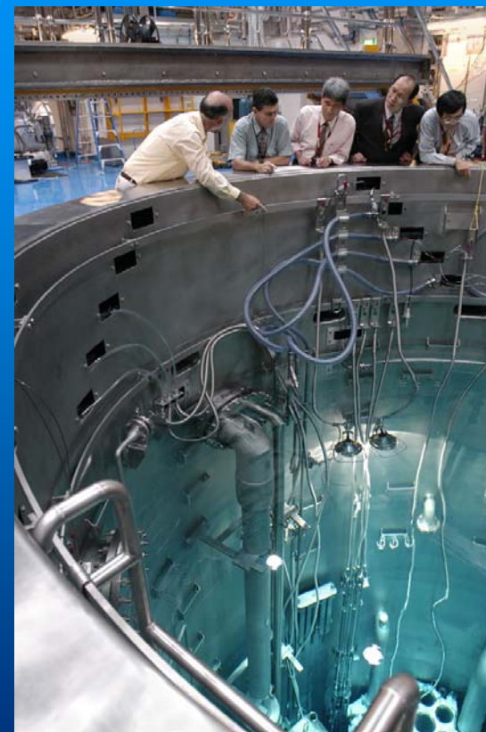
Hot Commissioning and Operation