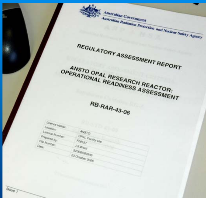
Regulatory Assessment Report Operational Readiness