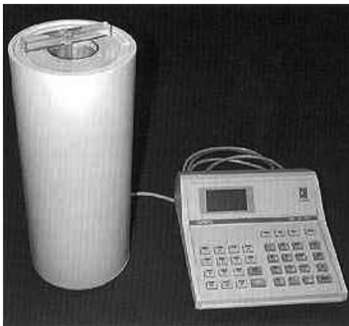
FIG. 3. Typical dose calibrator.

QC checks on all radiation detection equipment such as radionuclide calibrators and contamination monitors should be performed at regular intervals. The performance and maintenance results for all equipment including any air handling units, isolators, LFCs and radionuclide calibrators should be recorded and reviewed on a regular basis.