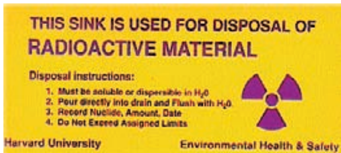
FIG. 2. Typical sign at a dedicated sink.