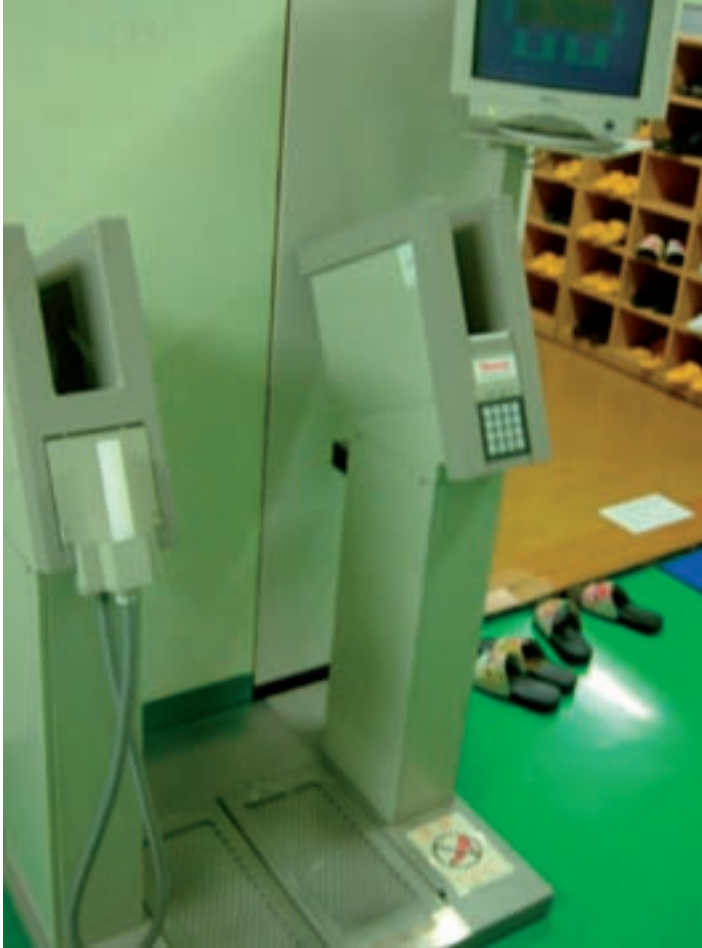
FIG. 4. Hand and feet contamination monitor.