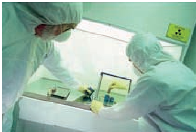
FIG. 1. Setting up an LFC.

This report is divided into modules of activities so that, according to the operational level of the intended service, the requirements needed can be accessed easily and consulted independently. Caution on radiation safety is advised at all levels.