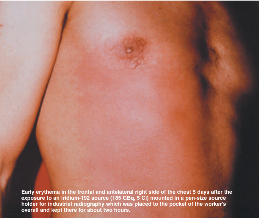
Early erythema in the frontal and antelateral right side of the chest 5 days after the exposure to an iridium-192 source (185 GBq, 5 Ci) mounted in a pen-size source holder for industrial radiography which was placed to the pocket of the worker's overall and kept there for about two hours.