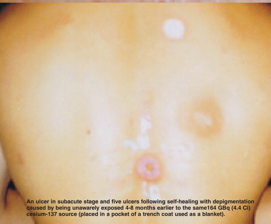
An ulcer in subacute stage and five ulcers following self-healing with depigmentation caused by being unwarily exposed 4-8 months earlier to the same 164 GBq (4.4 Ci) cesium-137 source (placed in a pocket of a trench coat used as a blanket).