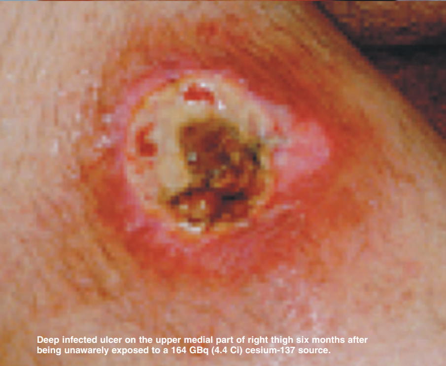
Deep infected ulcer on the upper medial part of right thigh six months after being unwarily exposed to a 164 GBq (4.4 Ci) cesium-137 source.