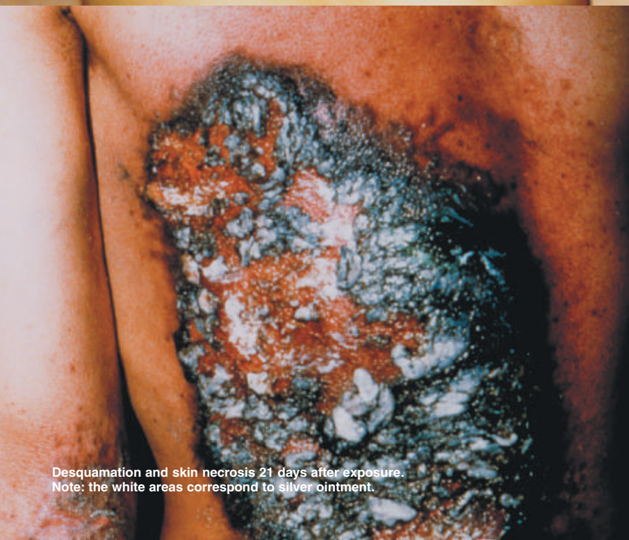
Desquamation and skin necrosis 21 days after exposure. Note: the white areas correspond to silver bintment.

Since the discovery of ionizing radiation, knowledge of its detrimental effects has accumulated. Despite considerable development in the techniques of radiation safety, accidents may happen which might injure people.