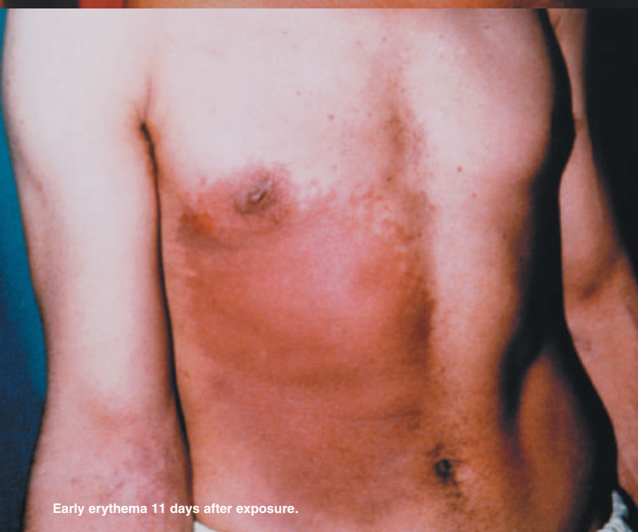
Early erythema 11 days after exposure.