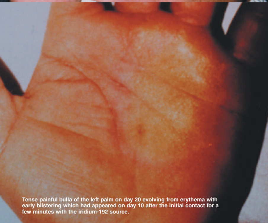
Tense painful bulla of the left palm on day 20 evolving from erythema with early blistering which had appeared on day 10 after the initial contact for a few minutes with the iridium-192 source.