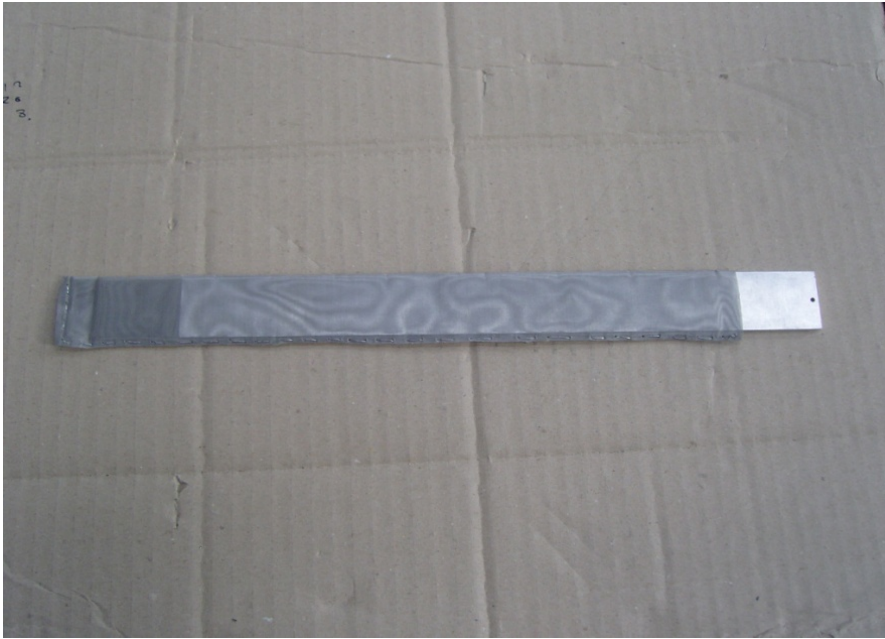
Fig. 2. ZrCo mesh bag fabrication.