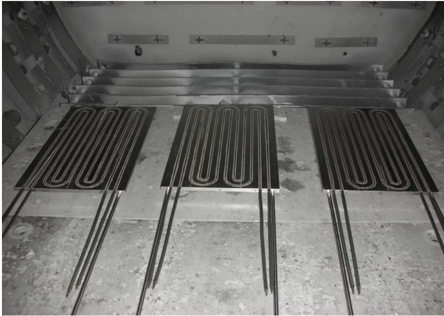
Fig. 4. Brazing of three rectangular tray plates.