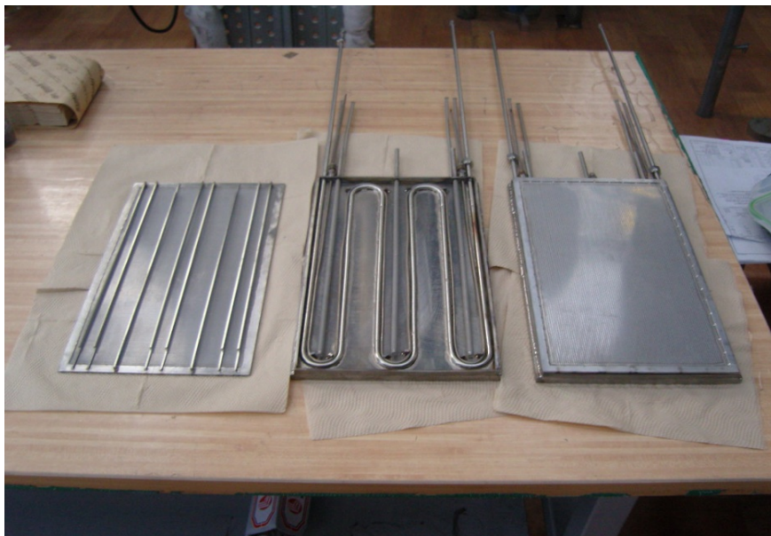
Fig. 3. Fabrication process of the tray type ZrCo bed.