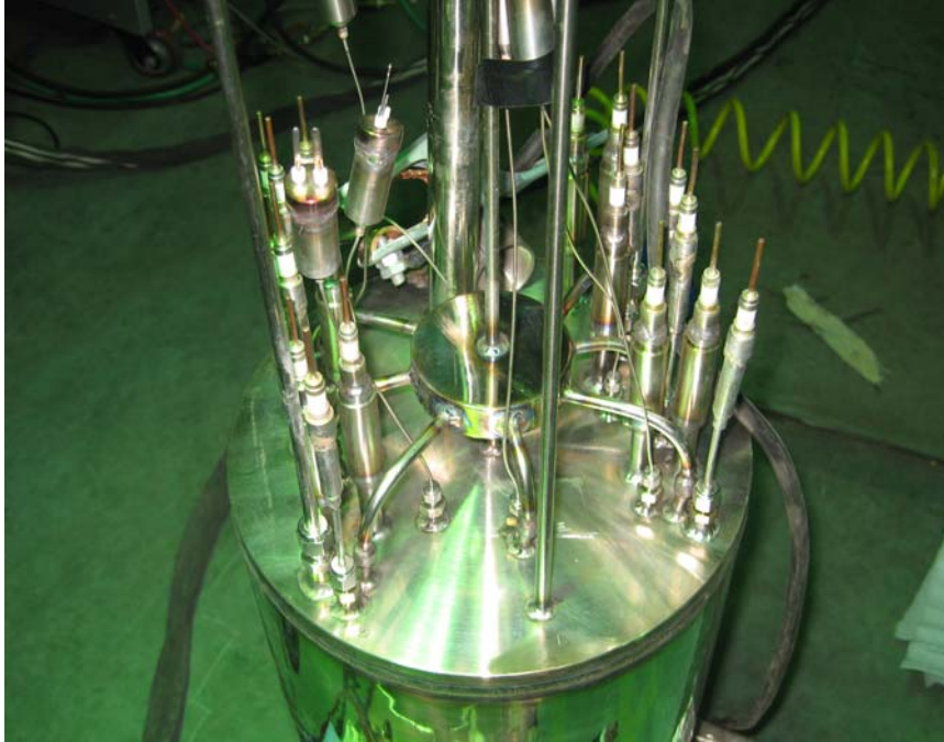
Fig. 6. Helium leak test for the primary and secondary vessels.

Vacuum and helium leak inspections were carried out on the primary and secondary vessels, vessel penetrations and feed-through to check leak tightness of the bed (Fig. 6). The results indicated no leak on the primary and secondary vessels and all penetrations and feed-through. The detection limit of helium leakage detector was 10^{-12} Pa · m 3 /s and the measured leak rates were < 1.0 \times 10^{-10} Pa · m 3 /s (Fig. 7). No leakage was observed.