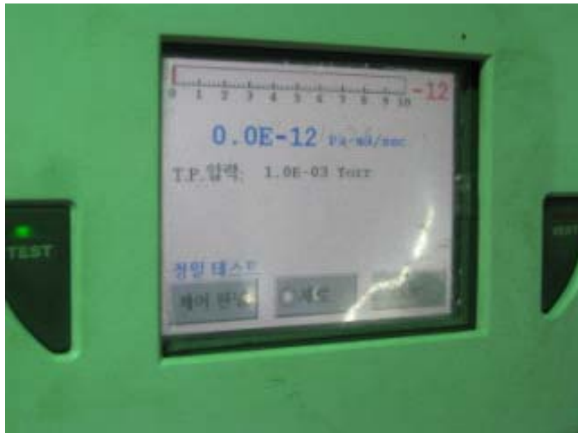
Fig. 7. Typical display in the helium leakage tests.