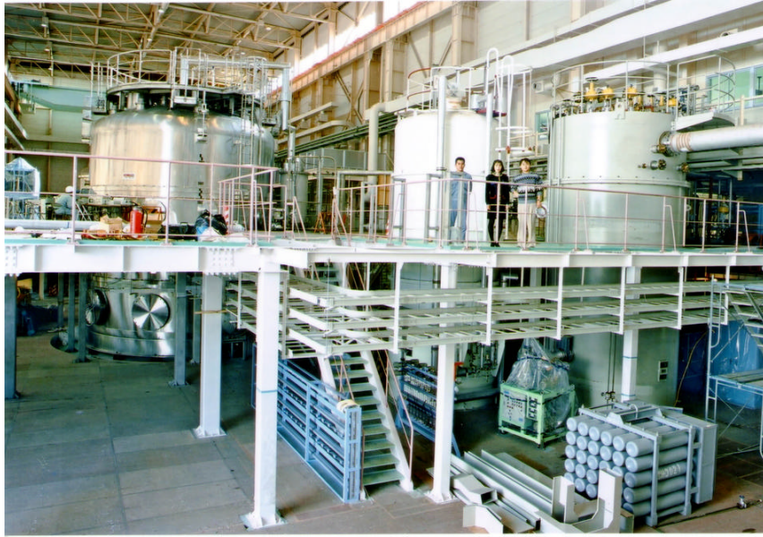
Fig. 3 Vacuum Tank and Refrigerator of the CS Model Coil Test Facility at JAERI