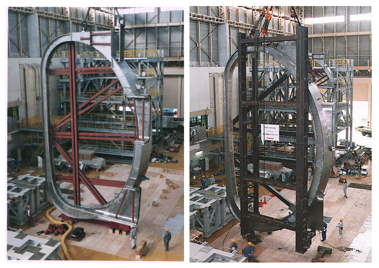
FIG. 1 View of the ITER full-scale vacuum vessel sector A

Following the completion of the model design, the fabrication of the full-scale sector model began in December 1995. The full-scale sector model corresponds to an 18 toroidal sector is composed of two 9 sectors, Sector-A and B, which are spliced and welded at the port center according to the current ITER design. In order to satisfy tight manufacturing tolerances and structural integrity, a combination of TIG /EB (electron beam) welding and TIG/MAG (metal active gas) welding has been adopted for Sector-A and B, respectively. As shown in Fig. 1 and Fig. 2, both Sectors A and B were completed in September 1997 on schedule and structural integrity was tested by pressure and vacuum leak testing. Although the different fabrication procedures and welding techniques were employed for the fabrication, the final dimensions of both sectors at field joint edge have successfully satisfied the dimensional accuracy of -3mm to the total height, total width and total wall thickness. As the result of fabrication, the essential technologies and procedures required for the fabrication of ITER vacuum vessel have been successfully developed and demonstrated.