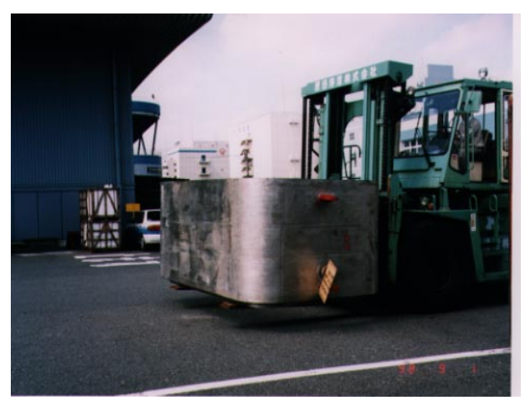
FIG. 4 View of the full-scale mid plane port extension shipped to Japan