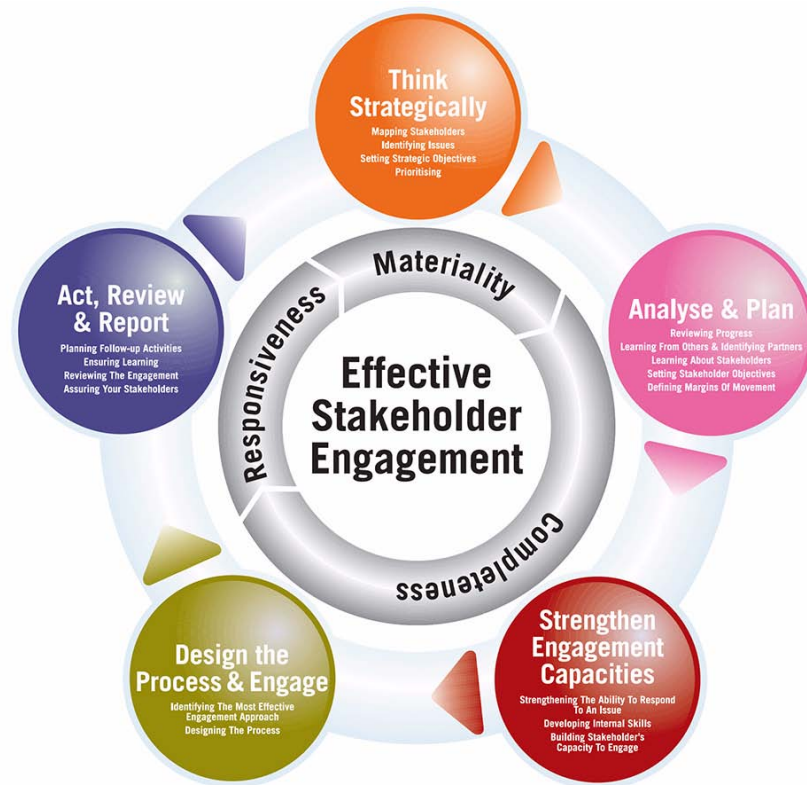
Fig. 1. A representation of the iterative learning cycle.

Stakeholders will have a range of opinions regarding the proposal, operation, expansion or closure of a nuclear facility, based in part on whether they are national or local in nature and on which of the many perspectives a stakeholder holds: elected officials, business interests, environmentalists, emergency planners, educators, interested citizens, or workers. An Overview of Stakeholder Involvement in Decommissioning [7] points out that there are both legal and moral imperatives to begin a nuclear programme with stakeholder interactions and states that: