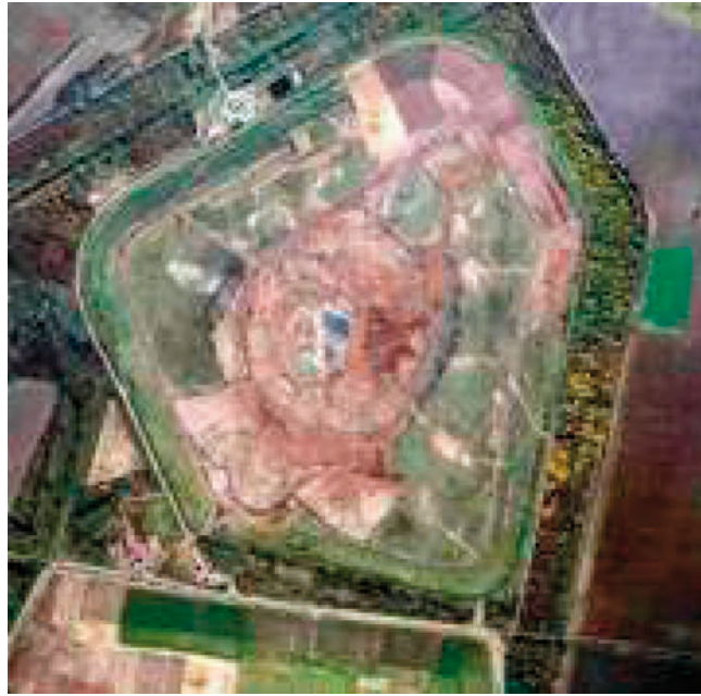
FIG. 5. Mecsek uranium mine tailings pond No. 1 during remediation work.