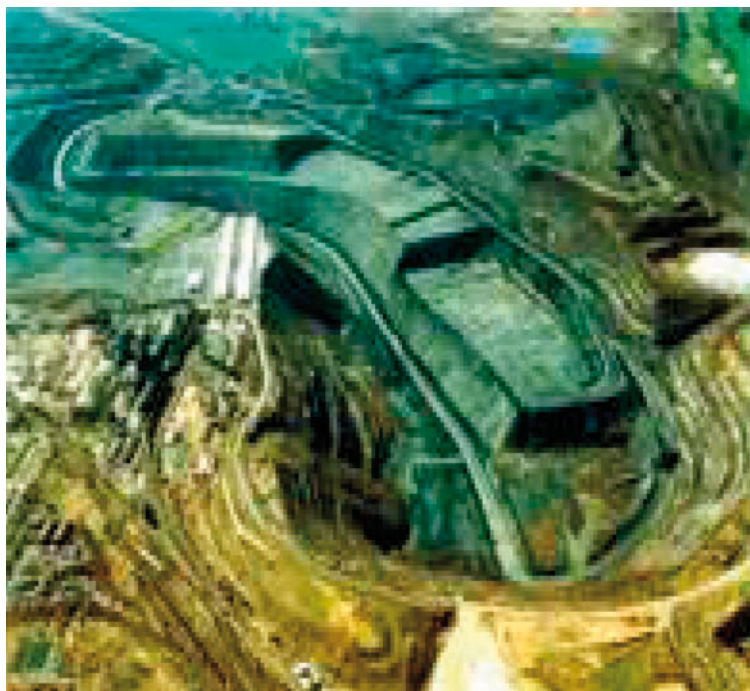
FIG. 1. Lichtenberg open pit.

Access to electricity and modern energy services is a necessary requirement for economic and social development. Over the next two decades the investment required for new power generation capacity in developing countries will amount to approximately $20.1 trillion [3]. However, energy industries in many developing countries are in urgent need of reform. The reform process includes commercialization and privatization of state owned utilities, and opening of markets to private investors as well as the changing of price policies.