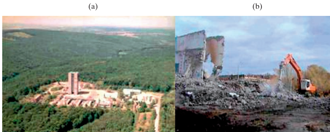
FIG. 4. Mecsek Mining District, Hungary. (a) Head frame No. 5 (b) Demolition of head frame No. 5

Generally, government agencies are not entirely motivated by profit considerations. In the long term it is projected that production will be dominated by free market factors, suggesting a greater proportion of production by non-government mining companies. This will place pressure on government production sources to be accountable to stakeholders. In the interim, a number of government operations and companies that have government support may produce in a manner that is not profitable by open market standards. Government supported production reflects national policies in maintaining stable supplies and may lead to social and environmental policies that are not sustainable from the perspective of profits at the mine and mill level, but the costs of which are considered acceptable for the entire nuclear fuel and power generation cycle for a particular country. These are considerations that individual countries should assess on a continuing basis as the industry evolves. Private companies should be acutely aware of such policies, whether they are supported by such policies or are operating entirely according to free market principles.