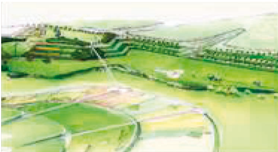
FIG. 3. Ronneburg open pit early stage of filling