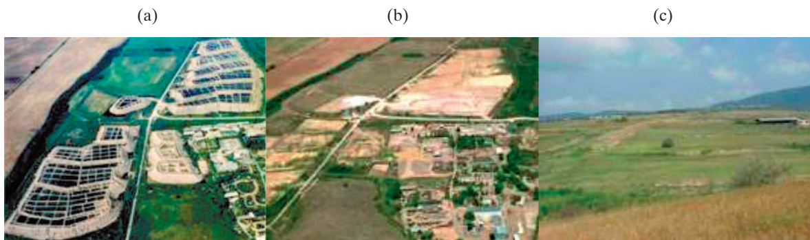
FIG. 6. (a) Mecsek heap leach operation; (b) the same view of the heap leach area during remediation; (c) heap leach area after remediation.

surrounding villages, employing a significant proportion of the local population, and supplying the country and its allies with the uranium that they deemed necessary for their purposes.