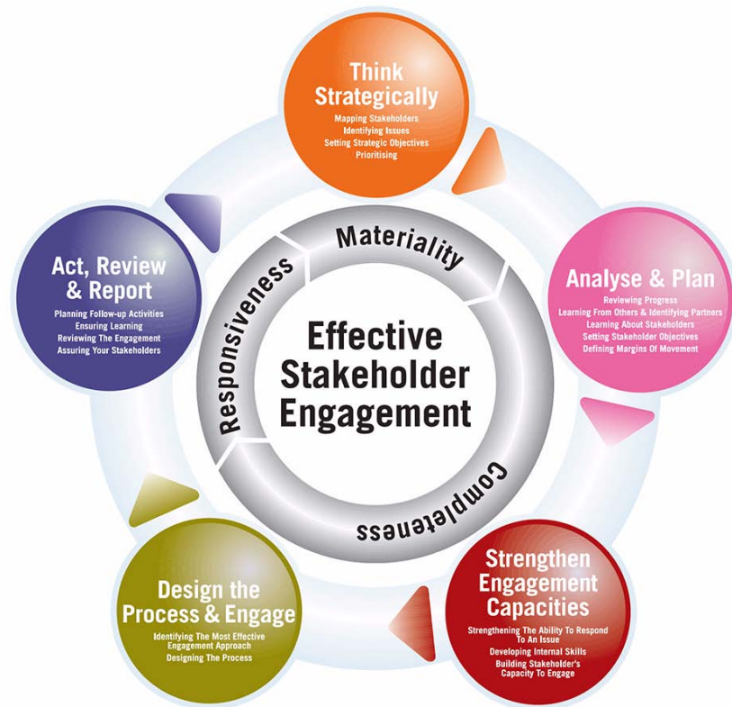
Fig. 1. A representation of the iterative learning cycle.

Stakeholders will have a range of opinions regarding the proposal, operation, expansion or closure of a nuclear facility, based in part on whether they are national or local in nature and on which of the many perspectives a stakeholder holds: elected officials, business interests, environmentalists, emergency planners, educators, interested citizens, or workers. An Overview of Stakeholder Involvement in Decommissioning [7] points out that there are both legal and moral imperatives to begin a nuclear programme with stakeholder interactions and states that: