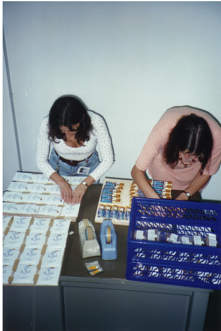
Sticking samples to a wooden board