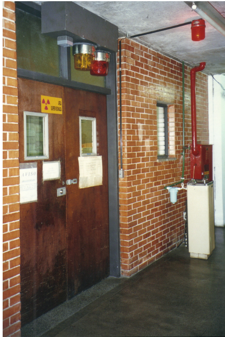
Entrance to the EB irradiation room