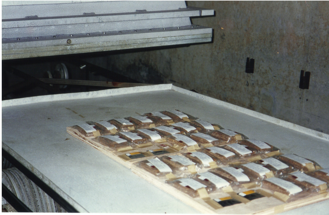
Fiber rich cookies