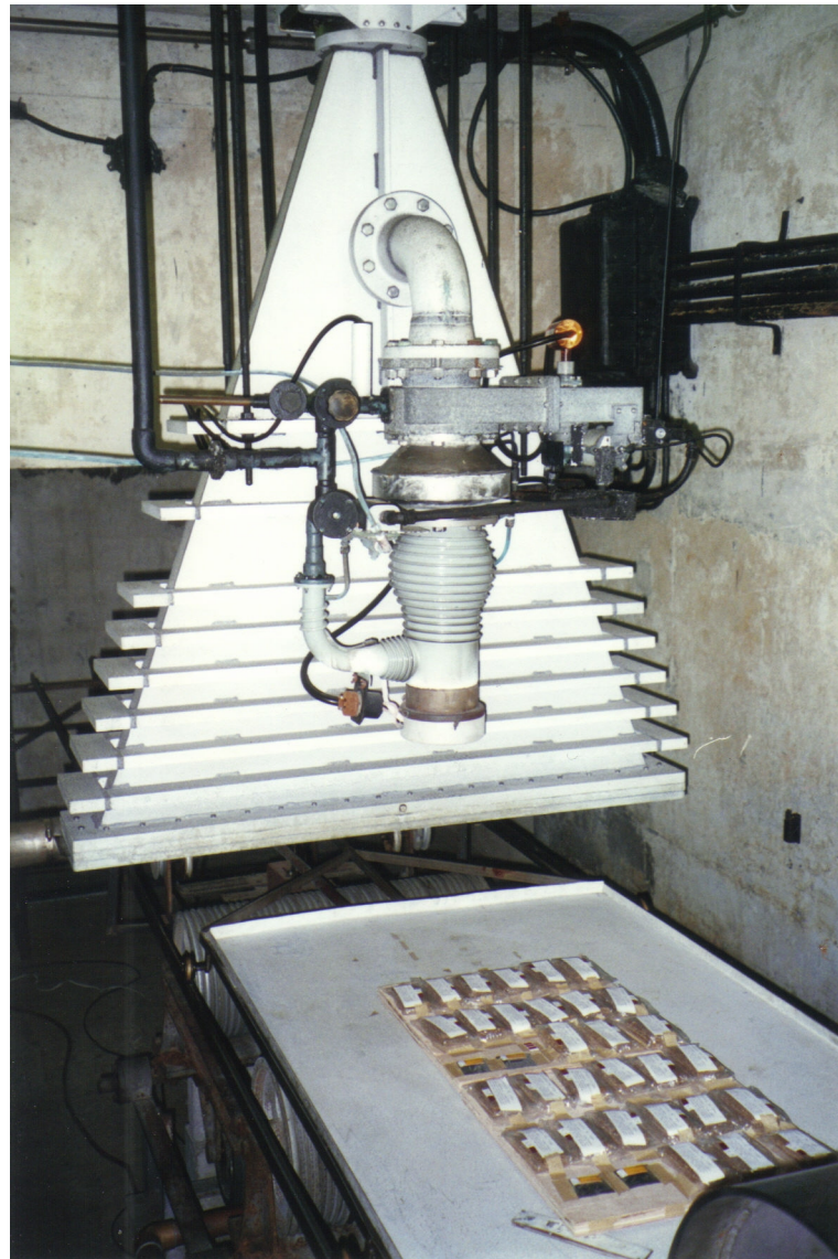
Electron beam accelerator Dynamitron (Radiation Dynamics Inc.)