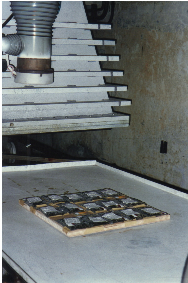
Instant dehydrated asparagus soup