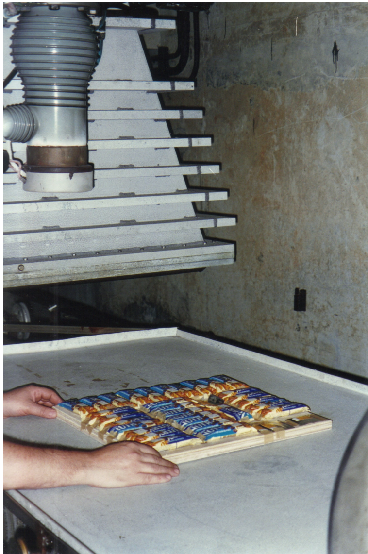
Fruit cereal bars