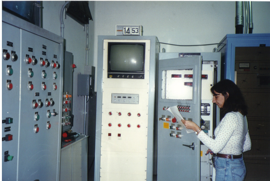
EB accelerator control panel