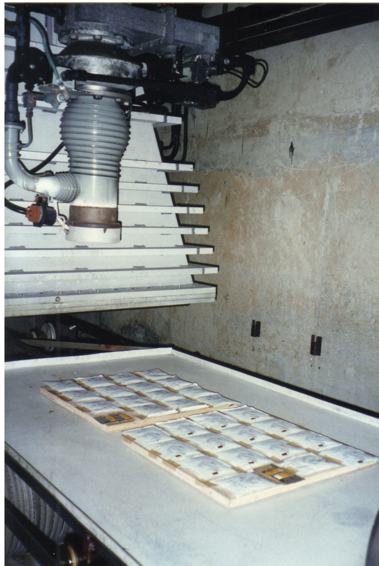
Instant Brazilian corn pudding