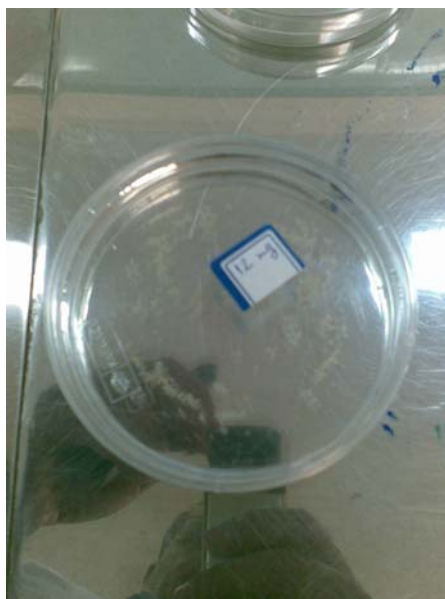
FIG 1. Rice bran was added into the sample.