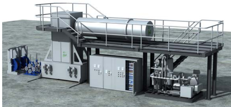
FIG 5. IBA Industrial Inc. Easy-e-Beam™ wire/tubing 800 keV, 100 ma unit