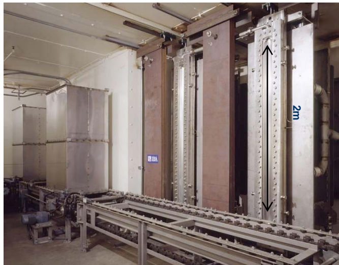
FIG 6. Totes Ready for X-ray Processing

The development of very powerful accelerators based on the Dynamitron® and on the Rhodotron® designs have enabled IBA Industrial Inc. to demonstrate that high power penetrating X-rays are a viable, electrically sourced, industrial alternative to the use of radioactive isotopes for medical device sterilization and food treatment [34]. In the United States, high power X-rays have been used since 2002 to decontaminate selected mail for the US Postal Service, which demands fast turn-around schedules. A Rhodotron can have multiple beam lines, for example at 5.0 MeV or 7.0 MeV, operating one at a time, that are aimed at X-ray targets to provide the most effective X-ray conversion for a given end-use application. Figure 6 shows the X-ray targets and product totes in a facility in Bridgeport, New Jersey, USA, that uses X-ray treatment to decontaminate parcel post.