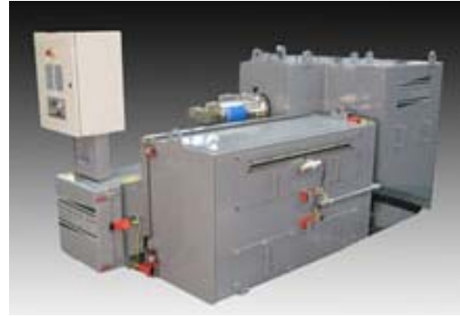
FIG 4. Broadbeam LE series