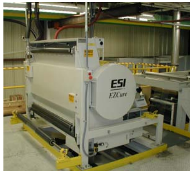
FIG 3. ESI EZ-Cure III