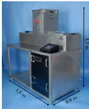
FIG 2. AEB Application Development Unit

Integrated systems, such as Getinge Linac's STERSTAR™, based on multiple low-energy EB accelerators, are being used to decontaminate the surfaces of materials before they enter aseptic packaging areas for medical product use [31, 32, 33]. Similar surface decontamination systems developed by AEB are being used in aseptic food packaging lines.