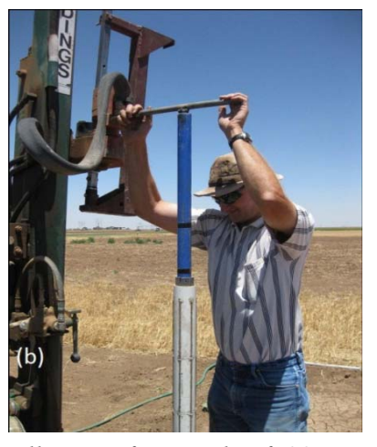
Fig.1. Installation of a stack of 20 cm long WOAT sensors into undisturbed soil by augering from within between alternative pushes with a hydraulic coring machine (Giddings).