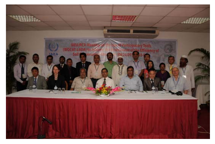
Participants at the IAEA/RCA meeting on the use of WOCAT-LADA tools

Malaysia: Second Research Coordination Meeting (RCM) of the CRP on Approaches to Improvement of Crop Genotypes with High Water and Nutrient Use Efficiency for Water Scarce Environments (D1.50.13), 24–28 June 2013, Kuala Lumpur, Malaysia