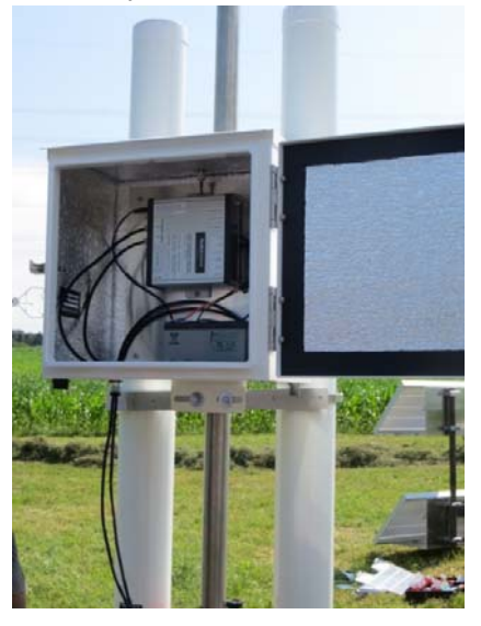
The CRS 1000/B model cosmic ray neutron probe

The SWMCN Laboratory recently acquired a cosmic ray soil moisture observation system (CosMOS, the CRS 1000/B model) to test its suitability for measuring area wide soil water content. While CosMOS has been shown to be able to measure soil water content in dryland systems (Franz et al., 2013), its suitability and usefulness for irrigation management has not been tested. The CosMOS technique is a non-invasive intermediate-scale soil water monitoring system that has a water footprint of an area equal to 40 ha (Desilets et al. 2010). Besides the large area covered by a single device, the measurement is not affected by variations in soil temperature, salinity, bulk texture and density (Desilets et al. 2010), of remote data accessibility and requires no more than one calibration of the system.