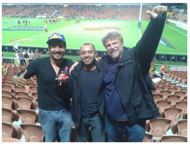
Three fellows enjoying rugby in New Zealand.

In the meantime, the fellows also assisted the host in New Zealand to upgrade the existing software for CSSI data analysis which will enable the analysis of larger sets of data and give more detailed and statistical information about the proportion of sediment contribution from different land uses in a catchment. An excellent example of how both trainers and trainees can benefit from this interaction. During the training they also enjoyed playing Rugby with the host country.