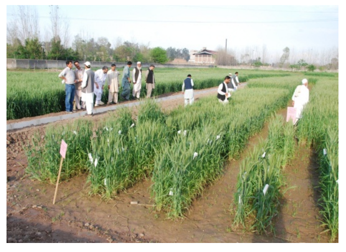
Water and nutrient use experiments in Pakistan

Ten research contract holders (Bangladesh, China, Kenya, Malaysia (two participants), Mexico, Pakistan, Peru, Uganda and Vietnam), one technical contract holder (Peru) and one agreement holder (South Africa) participated in the meeting.