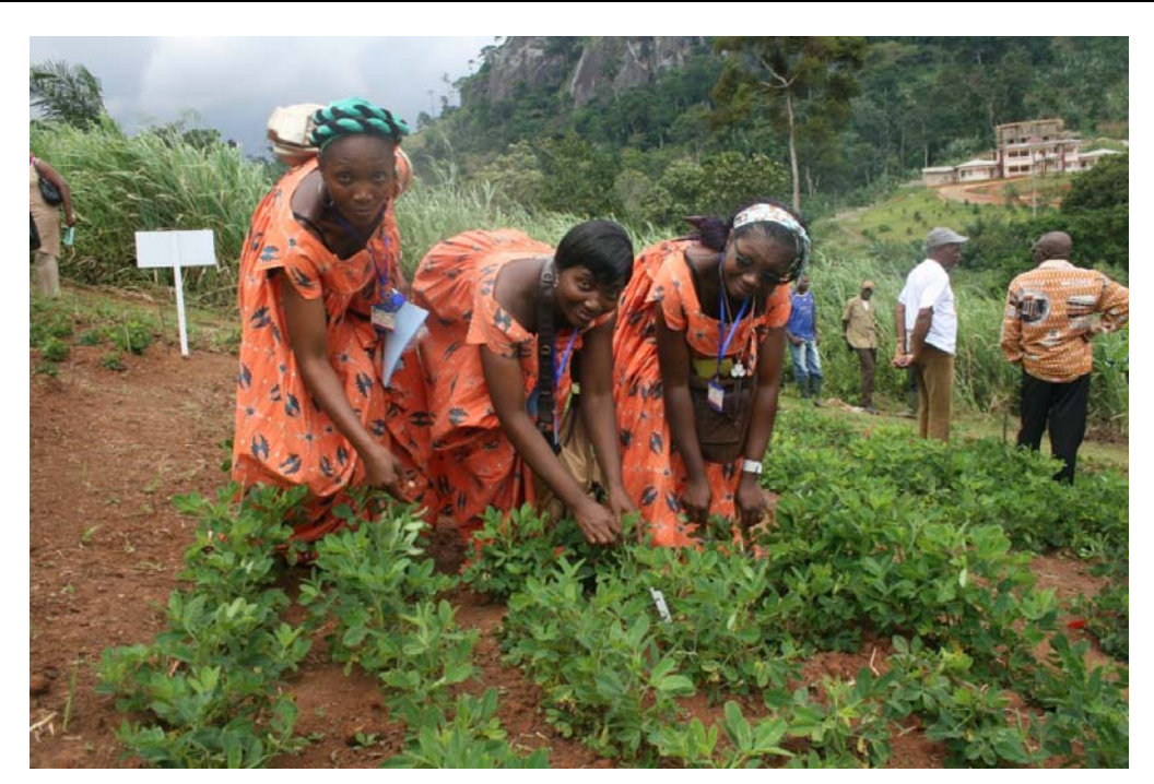
Improving soil fertility and integrated soil-plant management are critical for crop production in Cameroon, Africa

7 Activities of the Soil and Water Management and Crop Nutrition 10 Laboratory, Seibersdorf 26 14 Publications 31 15 Web Sites 32 22