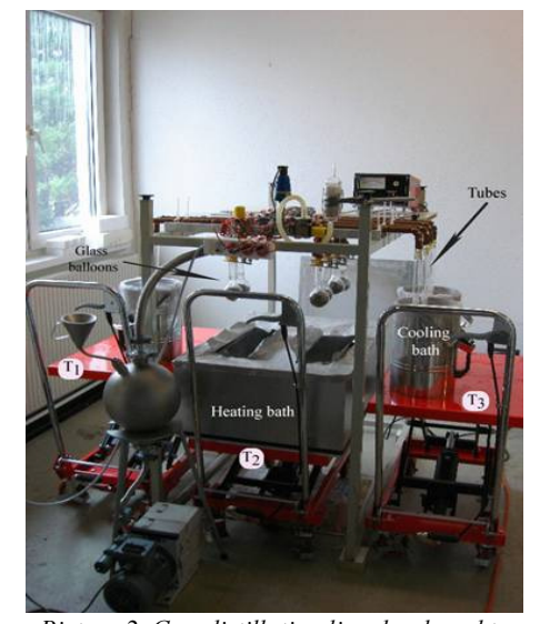
Picture 2. Cryodistillation line developed to process eight samples at the same time