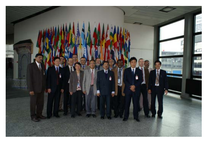
Participants at the final RCM

The fourth and final RCM of this CRP was held from 3 to 7 November 2008 at IAEA Headquarters in Vienna. Thirteen participants including nine contract holders, two technical contractors, and one agreement holder attended this RCM. See Status of Coordinated Research Projects (CRPs) section for more detailed information on this CRP.