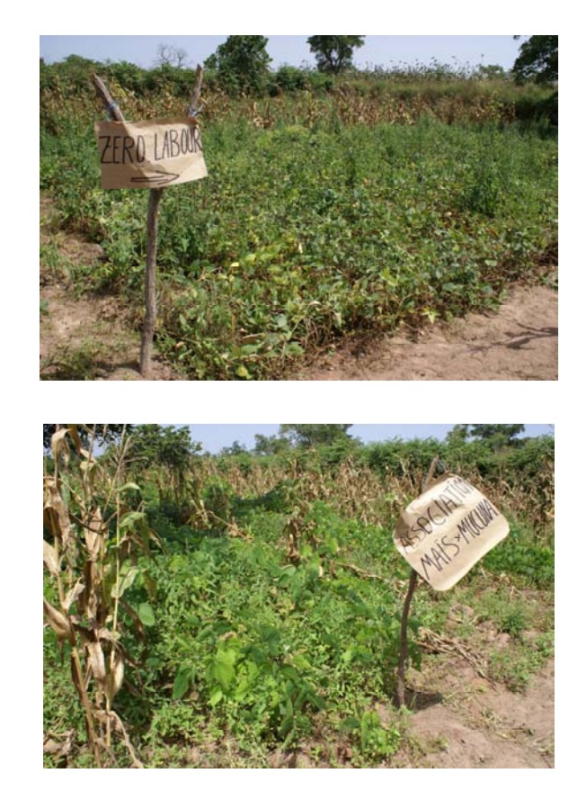
A field experiment in Bobo (Burkina Faso) to investigate (top) conventional (labour) and conservation tillage (zero labour) on crop yield and (bottom) the beneficial effect of growing maize in association with Mucuna (Mucuna can take up atmospheric nitrogen and subsequently provide it for maize).