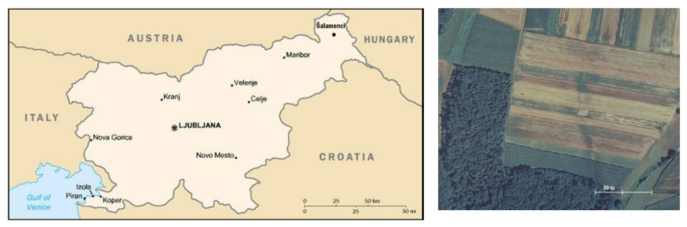
Figure 1 and Picture 1. Location and aerial photography of the forested studied site and adjacent agricultural fields near Šalamenci in East Slovenia

The study site is located in Pomurje – the sole Slovenian macroregion in which agricultural landscape still prevails (Hladnik, 2005) – in Goričko, a hilly area close to the Hungarian and Austrian borders at the beginning of the Pannonian plains, East Slovenia (Figure 1). An undisturbed forest situated in Šalamenci (46°44'N, 16°7'E) was selected as reference site. This forest covers approximately 1.9 ha with a flat topography (slope < 2%) at an average elevation level of 242 meters.