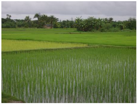
Soil and water management for increased rice production in the lowland coastal areas in Bangladesh