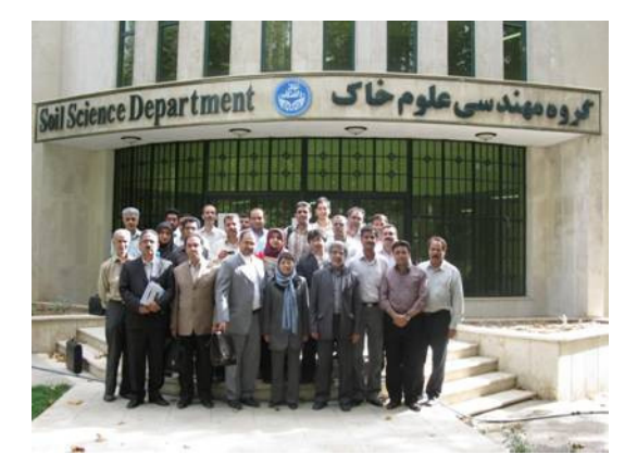
Workshop group photo taken outside Soil Science Department, University of Tehran

The Workshop highlighted the interest of the Iranian scientific community in strengthening its research capabilities in the use of nuclear techniques to address land and water management issues for food security and the farmers' environment.