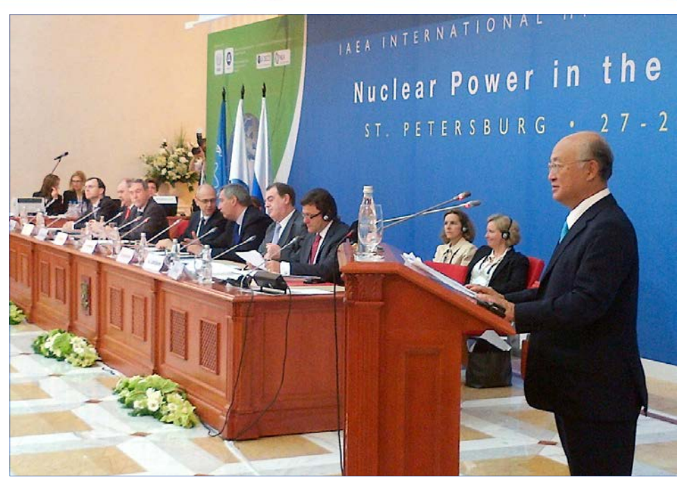
IAEA Director General Yukiya Amano addressing the Ministerial Conference.