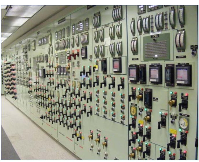
Control Panels in a Nuclear Power Plant.