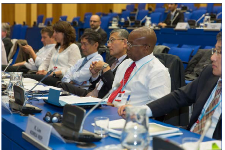
of the Steering Committee in Participants in the 20th INPRO Steering Committee Meeting, held in May 2013 at the IAEA.

The project on Synergistic Nuclear Energy Regional Group Interactions Evaluated for Sustainability (SYNERGIES) is one of the main activities within INPRO's theme on 'Global Nuclear Energy Scenarios'. This project has the largest number of participants and observers from INPRO Members, including 25 countries and the OECD's Nuclear Energy Agency.