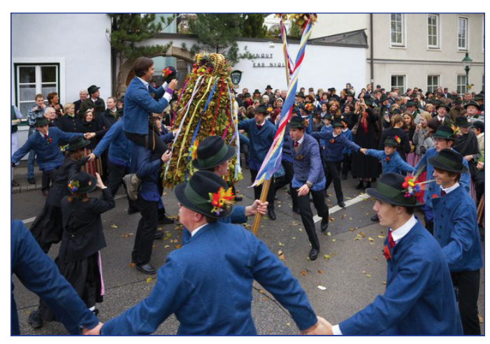
Annual wine growers festival.

Wine growing has a long tradition in this area and was first documented in 1248. Grüner Veltliner, Neuburger and Weissburgunder (Pinot blanc) are among the popular white wines cultivated here, while red wines include Blauer Portugieser and Zweigelt , to name a few. The many local wine growers serve their products in typical Austrian wine taverns, called Heurigen , along with simple homemade food. Heurig means 'this year' in German, which has given both the wine taverns and the new wine their name. Only in November of the following year does it become 'old' wine.