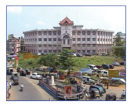
Civil Station, Thodupuzha.

The economy is mainly driven by agriculture, business and small industries. Farmers raise a variety of crops, pineapple, including coconut. rice. coco. tapioca, rubber, and banana. Ginger, turmeric, pepper and other spices are also grown in plenty. In recent years, tourism has been promoted.