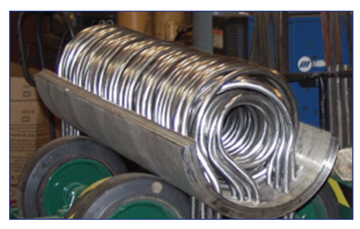
Helical Coil Steam Generator in MASLWR

ICSP Results: the helical coil steam generator is used for many integral type reactors. The ICSP found that the helical coil heat exchanger improves the heat transfer significantly compared to the conventional U-tube bundle steam generator.