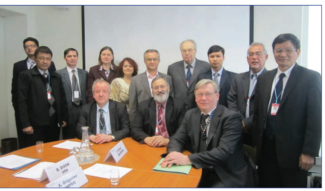
Participants in the Preparatory Meeting on the ROADMAPS project, IAEA, 18–20 March 2013.

The ROADMAPS project will be started in 2014 subject to the successful completion of the SYNERGIES collaborative project.