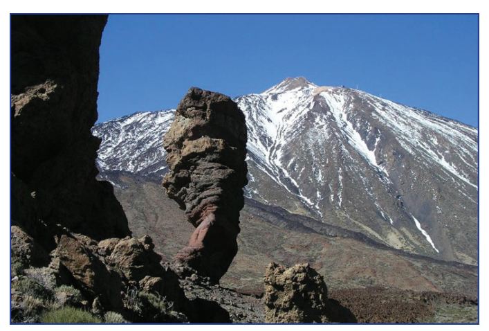
Spectacular lava rocks with Mount Teide in the background.

make it a special place, with a unique fauna and flora. Favourable weather conditions and an average temperature of 25 degrees C attract millions of tourists every year.