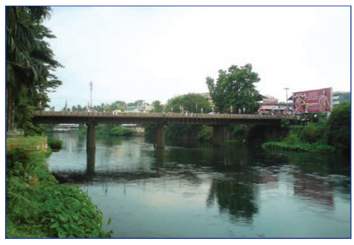
Bridge across the Thodupuzha River.

The town's main landmark is the Civil Station, housing most of the governmental administrative offices. I graduated from Newman College, which is the main educational institution in the district. The name 'Thodupuzha' is considered to be derived from two words, 'thodu', which means a small stream and 'puzha', which means river. It is believed that the streams