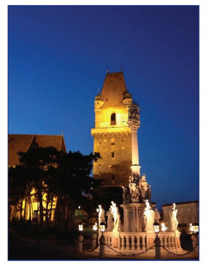
Percholdsdorf's tower was built between 1450 and 1521.

I've lived in the area for more than 20 years and still enjoy the charm of the small streets, historic houses that date back to the 15^{\text{th}} and 16^{\text{th}} centuries, little shops that offer customer-friendly personal service and the proximity to the Vienna Woods. The town is surrounded by fields, pastures and gently rolling vineyards.