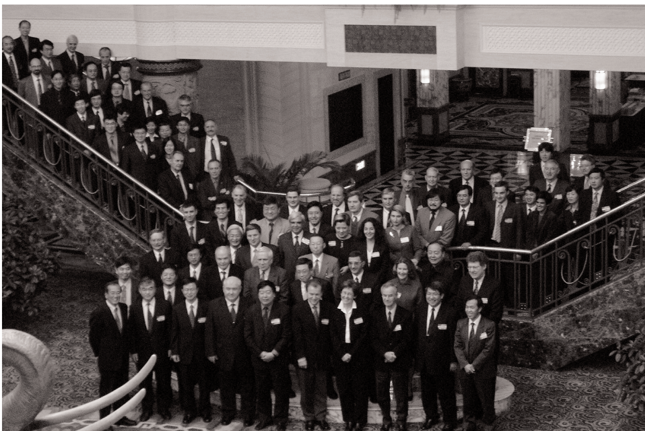
Participants at the Meeting

This was the first such Negotiations Meeting held in the People's Republic of China, and the first full Negotiations Meeting attended by the Republic of Korea, which formally joined the ITER partnership in June, 2003.