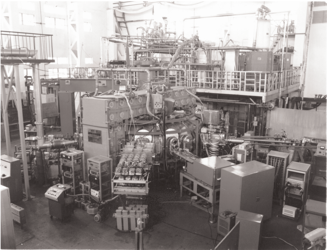
HT-7, Institute of Plasma Physics, Chinese Academy of Sciences, Hefei, People's Republic of China