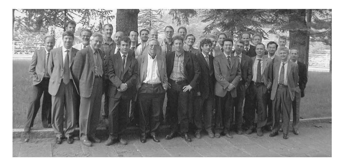
Fig. 3 - Participants in the Meeting

The next L-5 Meeting is provisionally scheduled for April 2000 in Naka.