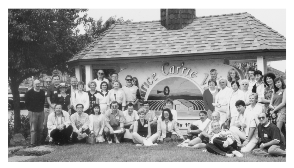
Wine Tasting in the Temecula Valley

The City took the hosting of ITER very seriously. A special San Diego Site for ITER Committee was created to facilitate ITER Joint Work siting in San Diego. A lot of thinking was including in preparing and organizing the support. Deep interest to the project has been generated and cultivated for all six years. The San Diego Site for ITER Committee not only won the ITER hosting in a competition with other contenders but continuously supported the Site for all six years.