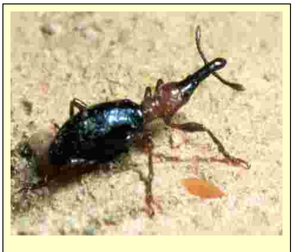
Cylus formicarius

As from early 1999, an SIT successfully component was then integrated into the control strategy. The aerial release is done by helicopter from which paper bags (9x20.5cm) containing 1,000 SPW adults of both sexes are released at a rate of 500 to 2,000 individuals per hectare. Initially, 100,000 sterile SPW adults were released weekly over Kume Island. As from 2001, following the increase in production capacity, a total of 1 million adults are released weekly. From 1999 until the first