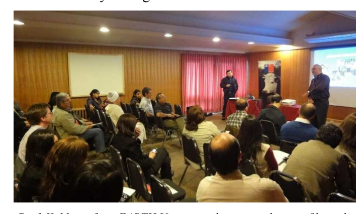
Prof. Kohlman from EARTH University discussing the use of bioindicators in the evaluation of water quality

In relation to biomonitoring it was agreed that the sampling design would encompass at least three within site and between site replicates, and the methodology should be as standardized as possible. For the bioassays it was agreed that each laboratory would utilize control charts and use the same control toxic substance to monitor the sensitivity of the biological agent (Daphnia) for acute and chronic toxicity testing.