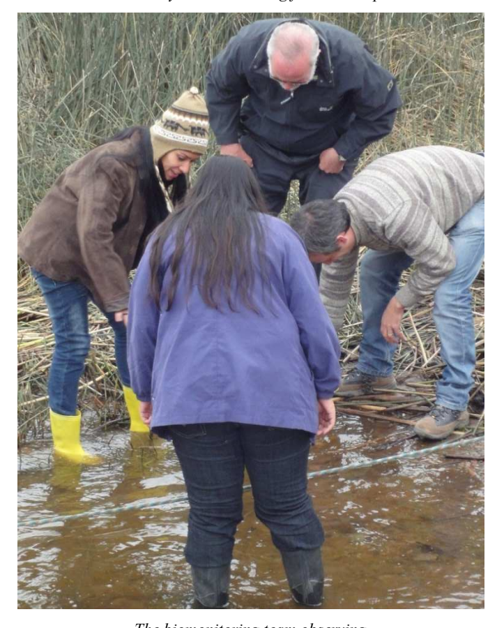
The biomonitoring team observing one local species of macroinvertebrate