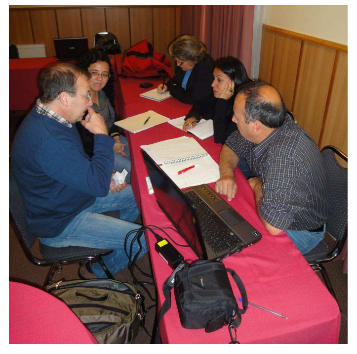
The bioassay team discussing future work plans

The training was evaluated as successful by all participants.