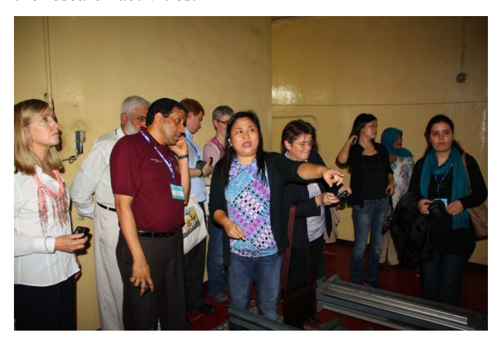
Tour of the irradiation facility at the Philippines Nuclear Research Institute (1/2)

During the meeting, each participant gave a detailed presentation on their research and produced a short written summary that included information on their progress, their collaborating partners, and summaries of what has gone well and what was not as successful as they had hoped, as well as an outline of their plans for the next research phase. The CRP research protocol (produced at the first RCM and included in the first RCM meeting report) was reviewed and modified slightly to include guidance on sensory trials and to make other necessary minor amendments. The foods to be researched were reviewed and were summarized, project outputs were discussed and the participants also reviewed the perceived strengths, weaknesses, opportunities and threats related to the research activities.