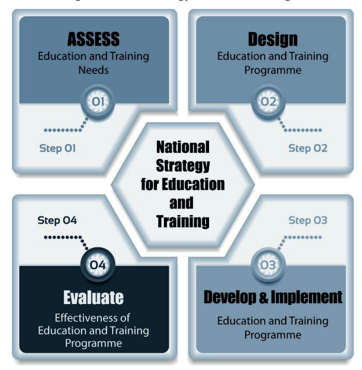
Figure 1: Steps to establish and maintain a national strategy for education and training in radiation, transport and waste safety.

The aim of the module is to assess the provisions to establish a national strategy for E&T in radiation, transport and waste safety, commensurate with the current and foreseeable facilities and activities and in compliance with the national legal and regulatory framework for E&T. The module follows the different steps in establishing and maintaining a national strategy, as shown in Figure 1.