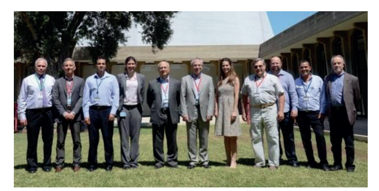
The EduTA Team and the Israeli Counterparts

The EduTA mission to Israel was conducted in May 2015.