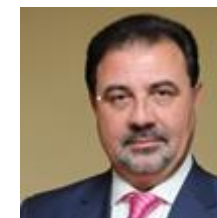
Fernando CASTELLÓ BORONAT Commissioner Spanish Nuclear Safety Council (CSN) SPAIN