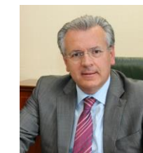
Javier DIES Commissioner Spanish Nuclear Safety Council (CSN) SPAIN