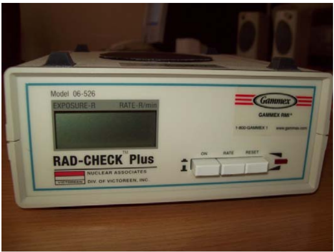
Figure 2.2: Victoreen Rad check meter

This test checks that the radiation output [mGy/mAs] remains constant as the mA is varied. For this test the dose Victoreen Rad check meter was used (Figure 2.2).