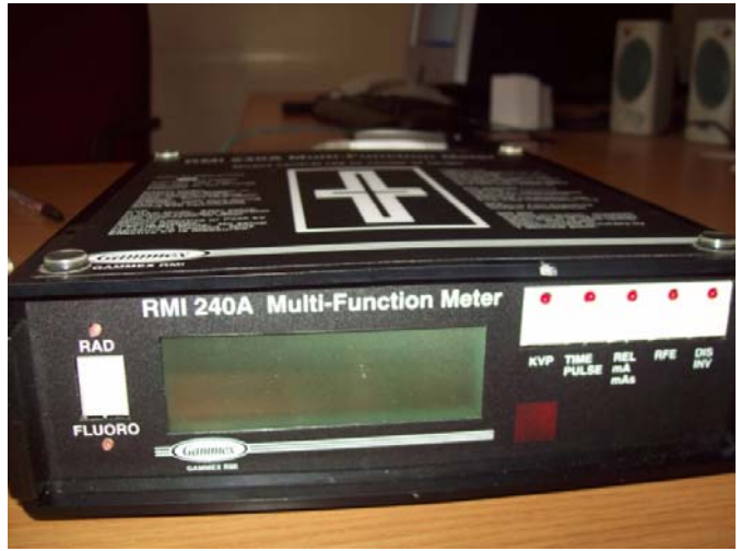
Figure 1: RMI Multi functional meter

Firstly the RMI meter was set at 100 cm from x-ray tube focus, and was centered using the laser. 20 mAs was set on the machine control panel. The kVp was then measured from 50-125 kVp in increment of 10. At every set kVp, the measured kVp was recorded. The percentage difference between the set and measured kVp was calculated and should be within \pm 5%.