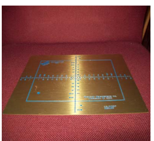
Figure 2.3 Beam alignment tool