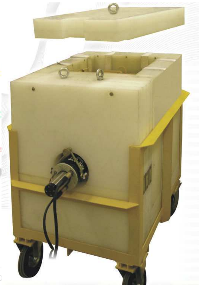
Active neutron assembly