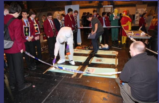
Glasgow 2012 Schools Event