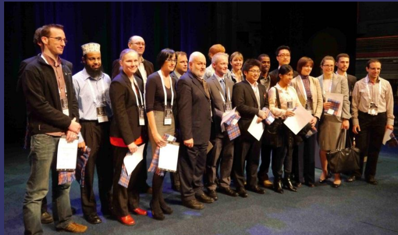
Glasgow 2012 Young Person's Prize