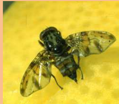
Mediterranean fruit fly

The IPPC has approved one generic dose: 150 Gy for all tephritid fruit flies on all commodities.