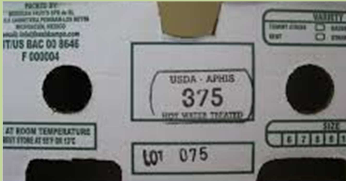
Mango box with hot water treatment stamp

Acceleration in PI could come from mangoes. Mexico exports >180,000 tons (and growing) to the US annually; almost all treated with hot water immersion which produces a lower quality mango than PI and has resulted in food poisoning due to unsanitary water not hot enough (at 46°C) to kill bacteria.