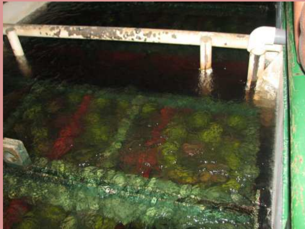
Aging hot water immersion equipment

Hot water immersion equipment is aging, and as marketers and consumers become accustomed to safety and better quality of irradiated mango a quantum shift to mango irradiation could occur if the facilities are in place.