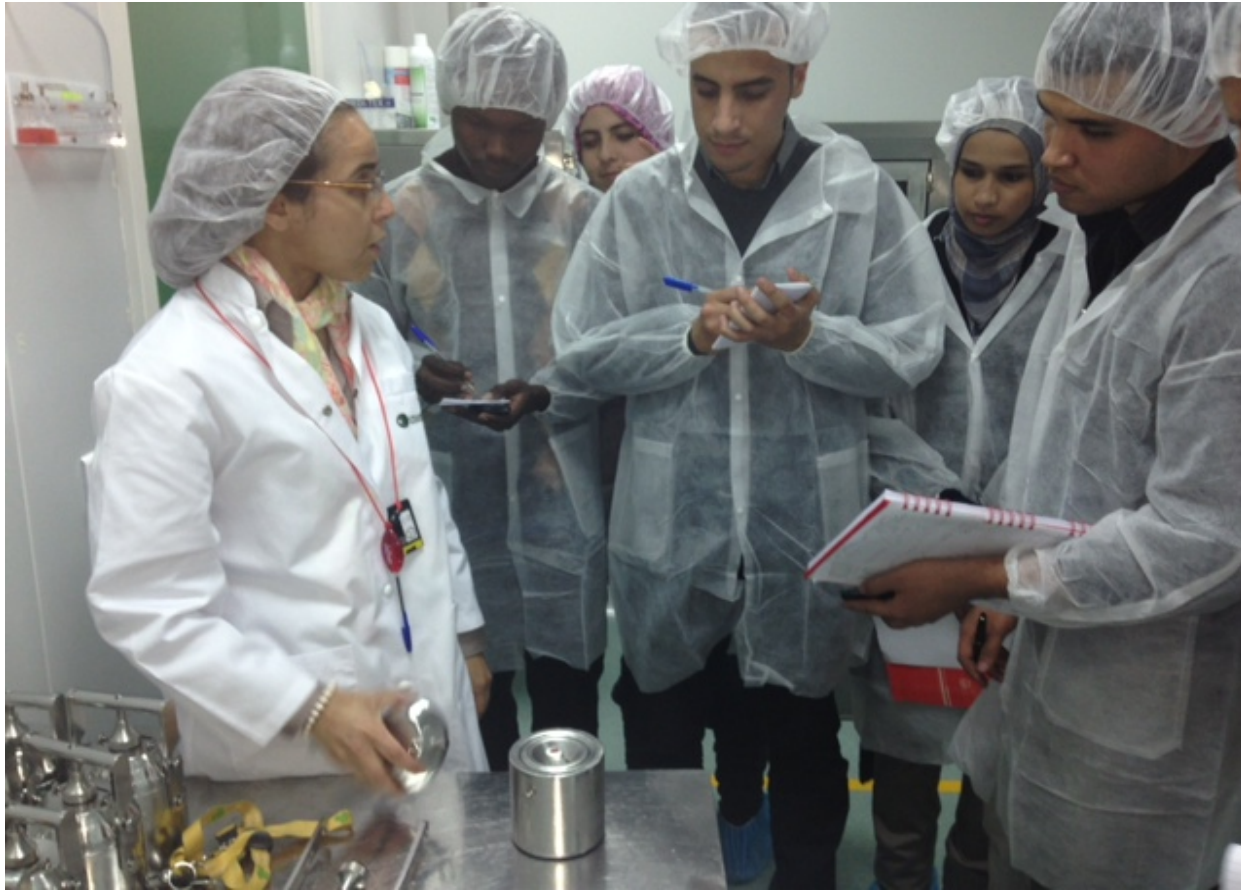
Visit of Cyclopharma Company (Cyclotron) -Casablanca-