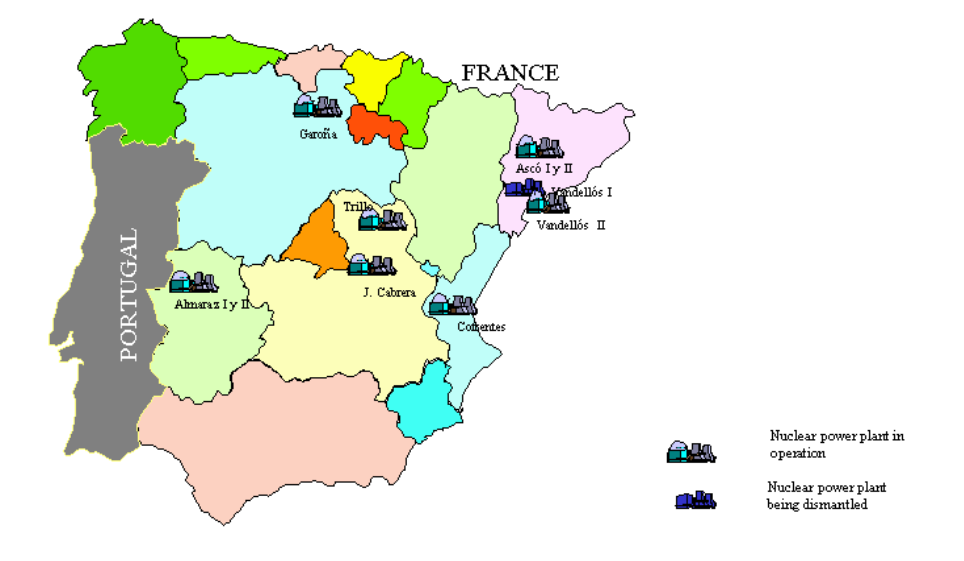
FIG. 1. Location of Spanish NPPs