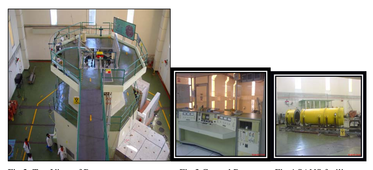
Fig 2. Top View of Reactor

The view of the reactor top, control room and experimental facility are shown in Figures 2 - 4 respectively.