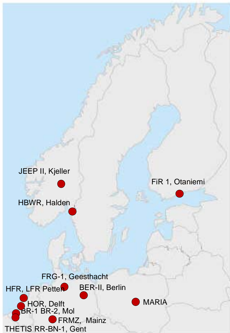
FIG. 3. Research reactors in Scandinavia and the northern European Union.

FiR 1 has an important regional role in producing short lived isotopes as well as in education and training as there are only a few research reactors in Scandinavia and the Northern Europe (EU) suitable for these tasks (see figure 3.). The production of isotopes for industrial measurements has been growing steadily in the recent years.