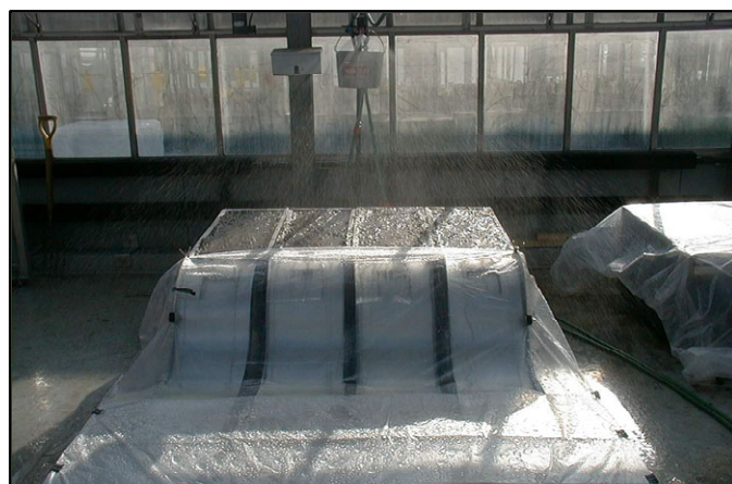
Fig. 4 Rainfall simulation on experimental soil equipped plots