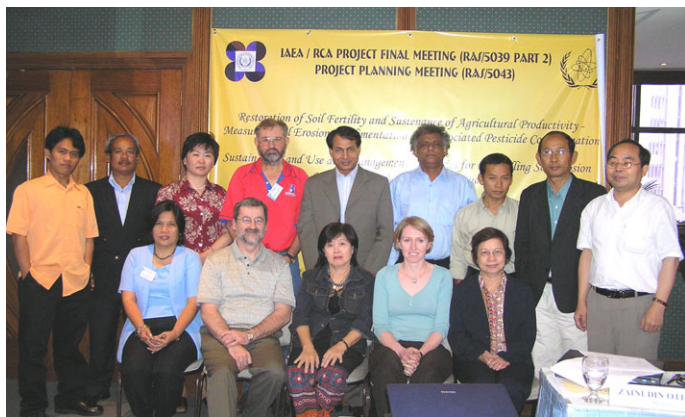
Participants to the Manila meeting of TCPs RAS/5/039 part II and RAS/5/043

raising the point of selecting the appropriate model for a given situation.