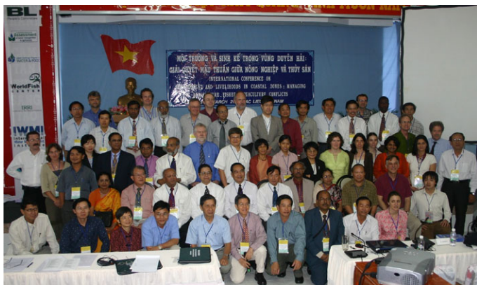
Participants from over 15 countries plus some local scientists and policy makers at the International Conference on Environment and Livelihoods in Coastal Zones, Bac Lieu, Vietnam (Courtesy of L. Nguyen, March 2005)

The highlights of the Conference were the integrated land-water management approaches that are relevant to those used by the Soils Team in addressing water resource management for agricultural productivity and environmental sustainability. Some of these highlights were: