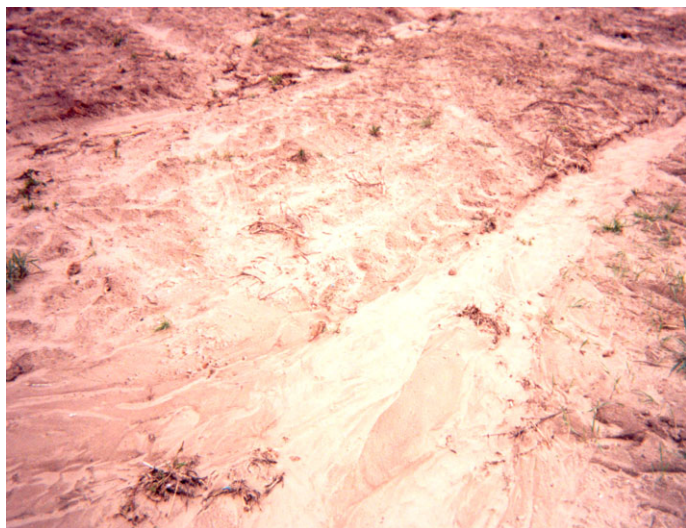
Fig. 1 Soil erosion and degradation after rainfall events. Soissons, France

Conservation of soil and water resources is a major concern in the context of sustainable agriculture and environ-