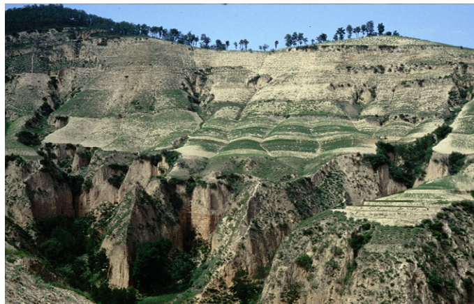
Severely gullied cropland

The main objective of this first meeting was to review the work plan of the participating countries (team composition, planned activities, and needed support) to make sure they are in line with the objectives of the project. A Project Framework Matrix and a global timetable were also developed. Dates and locations for future activities were also agreed on. Finally, recommendations were expressed by the participants to IAEA and countries, in terms of support to the activities needed by the project.