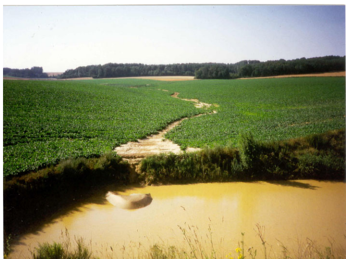
Fig. 2 Soil erosion, sediment transport and deposition in an hydrosystem. Soissons, France

ment. Runoff and associated water erosion (Fig 1), is a major factor of non-point source pollution and constitutes the principal way of conveying sediments, agri-chemicals plus nutrients to receiving waters and thus contribute to water quality degradation (Fig 2).