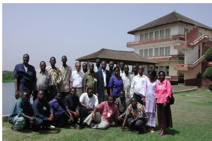
(Participants to the Bamako meeting of TCP RAF/5/048