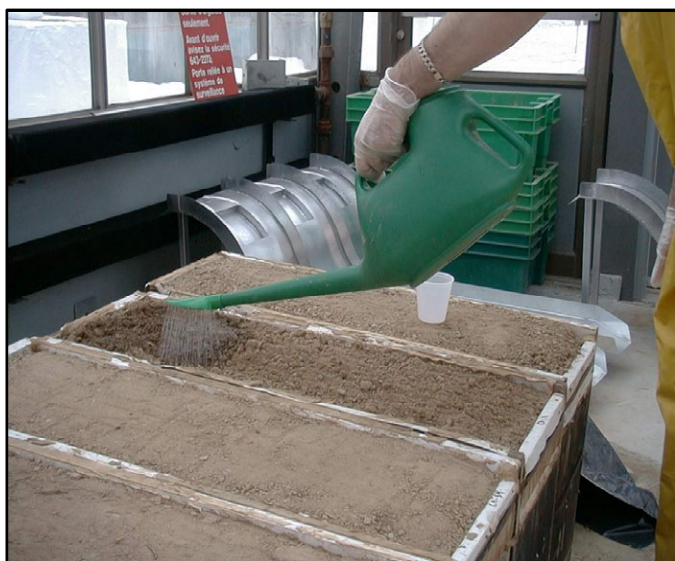
Fig. 3 Superficial insertion of ^{134}\text{Cs} at the soil-plot scale

It was planned to develop researches to investigate the water erosion effect on particle size and nutrients (N, P) and develop different new aspects of radioisotope techniques (relationship between the soil and radionuclide loss, relationship between soil quality parameters and soil loss as estimated by radioisotopes, relationship between the severity of erosion and the quality of eroded sediments). An experimental study was undertaken at the plot scale using simulated rainfall and ^{134}\text{Cs} enrichment. Like ^{137}\text{Cs} , this radioisotope (half-life: 2,05 years) is known to be strongly adsorbed onto exchangeable sites of soil clay particles and organic matter. Physical processes like erosion are the dominant factors moving this isotope within the landscape and its measurement is easy by gamma spectroscopy.