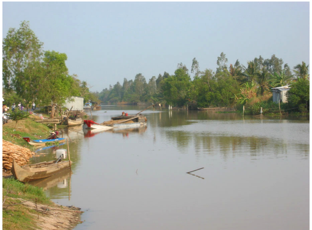
Land-water connectivity in Mekong Delta, Vietnam: Important consideration in sustainable agriculture and water quantity-quality