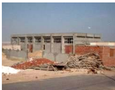
Figure 1: Main Building of Test Facility

It is hoped to start the experimental programme by the end of 2003.