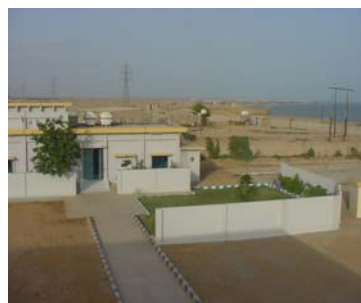
SWRO Plant at KANUPP