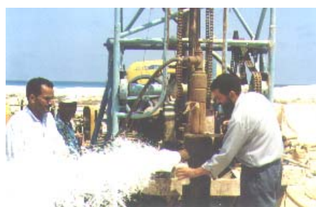
Figure 2: Water Flowing out of Beachwell