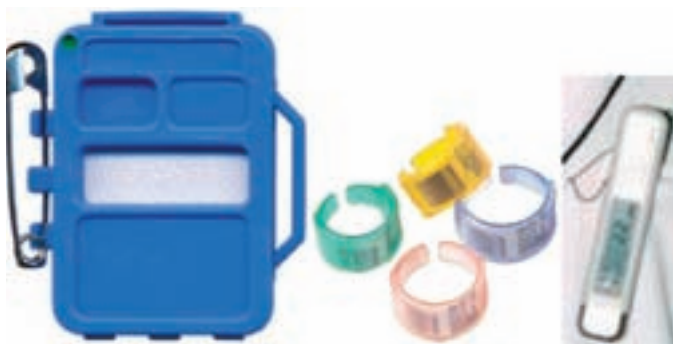
FIG. 6. Typical film badge, finger ring dosimeter and pocket dosimeter.

To operate a radiopharmacy performing the procedures described for operational level 2a, at least two staff members are required. In particular, an assigned staff member is required who has received training, in addition to what is specified for operational levels 1a and 1b, in the following areas: maintenance and operating procedures of radioactive ^{99m}\text{Tc} generators, radiolabelling of commercially available kits using generator eluates, QC and generator performance, QC tests for radiopharmaceuticals, radiation monitoring, and safety regulations and related documentation. Training in aseptic procedure for generator elution, transfer of sterile solutions from one sealed vial to another, the use of biological containment devices (biological safety cabinet, isolators) and the use of shielded water baths is also required.