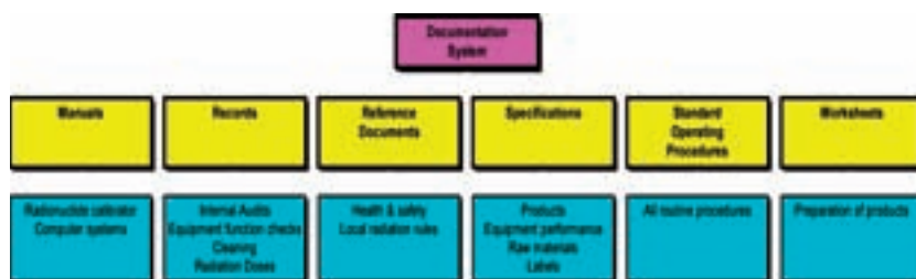
FIG. 8. Model recording system.

The sections below list the additional records that should be maintained.