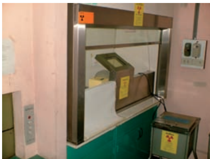
FIG. 5. Typical fume hood.

In addition to the facilities described in operational level 1a, a fume cupboard with suitable filters (Fig. 5) that can handle volatile radioactive materials is required for ^{131}\text{I} solutions. There is need for sufficient space for a non-radioactive waste container and sufficient bench space to receive radioactive packages, to perform QC procedures and space for record keeping and administration. There should be a secure system for delivery and storage of ^{131}\text{I} therapy doses.