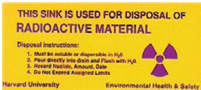
FIG. 2. Typical sign at a dedicated sink.