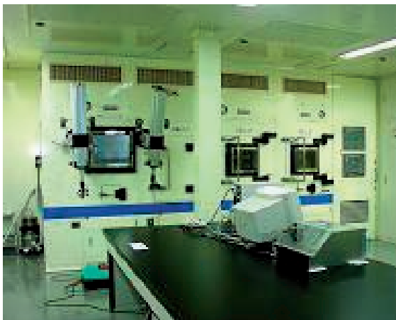
FIG. 9. Typical PET hot cell.

A full QA programme should be in place when preparing PET or therapeutic radiopharmaceuticals for human administration. Due care is essential to prevent any cross-contamination.