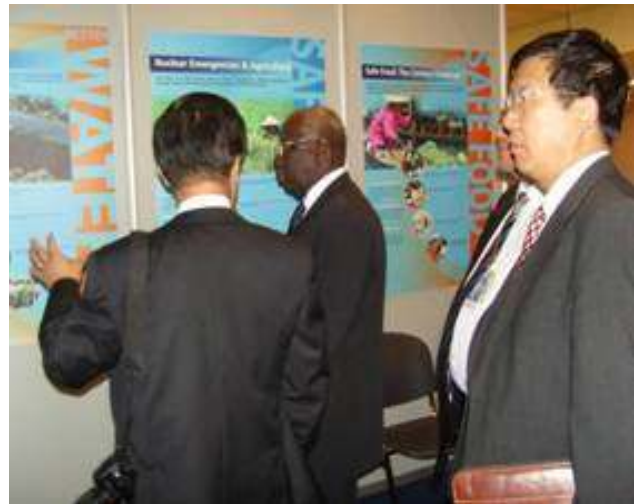
The DG of FAO and Mr. Liang Qu, Director of the Joint FAO/IAEA Joint Programme at the IAEA General Conference Poster Display

Similar treatments were used for the solution culture display, except that the N treatment was 20 mg L -1 and the P 5 L -1 in the same combinations as the soil culture. The display clearly demonstrated that the application of P fertilizer enhanced root development and crop growth through enhanced N uptake by crops. Crop growth and root development were more impaired when no P was applied (despite the application of N) than in the treatments where P was applied but no N. The effect of no added P on plant growth was more severe in the cereal than in the legume.