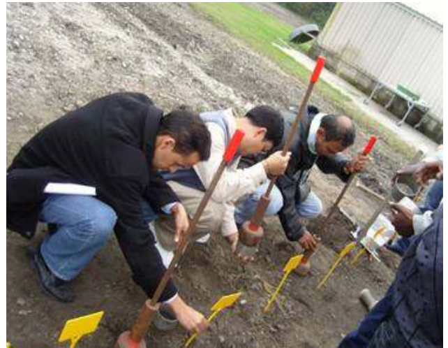
Field training for participants

in Großenzersdorf. Participants also prepared individual proposals for presentation outlining the applicability of the proposed project to their individual developing countries.