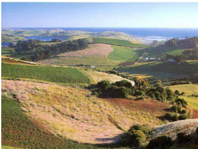
Study area in the Coastal Mountains of the Araucanía Region, Chile

These problems have prompted a shift from conventional tillage to no-till without burning of crop residues systems. The implementation of no-till systems has been reported to cause significant improvement in soil quality. However, there is still a need to collect information on the precise magnitude of the decrease in soil loss associated with the shift from conventional to no-till systems. Such datasets can provide confirmation of the likely impact, and therefore effectiveness, of such changes in the land tillage system.