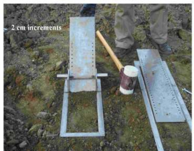
Figure 2. A simple scraper to collect soil profile samples in a arrange of increments of 2 mm to 2 cm for measuring ^7\text{Be} , ^{137}\text{Cs} and ^{210}\text{Pb} activities developed by CAAS-ALMERA in 2003