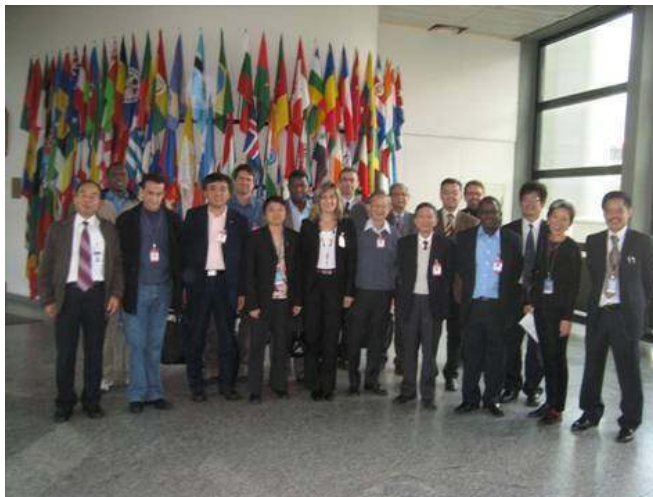
Participants of the first RCM of the CRP D1.20.09

Thirteen participants, consisting of nine research contractors (two from China and one from each of the seven countries, Burkina Faso, Malawi, Morocco, Pakistan, Turkey, Vietnam and Zambia), two technical contractors from USA, and two agreement holders from Austria and Spain attended the first RCM of this CRP.