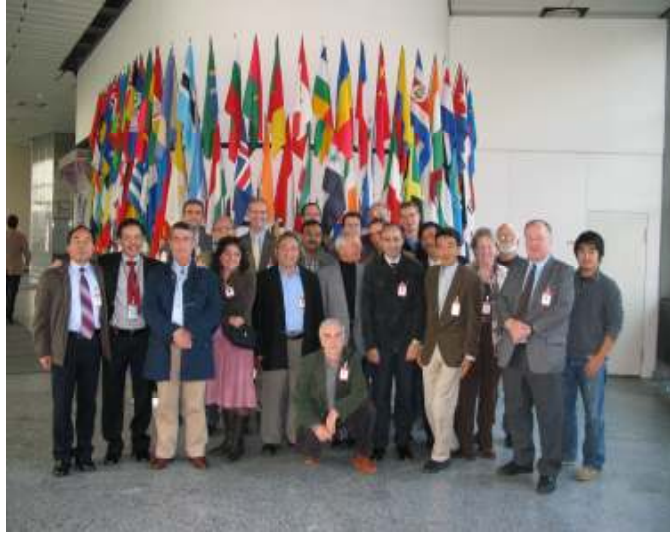
Participants at the final RCM of the CRP D1.50.08