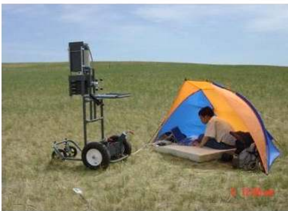
Laboratory Gamma Spectrometry In-situ Gamma Spectrometry Detector: BE5030

The ALMERA-CAAS Laboratory has been actively supporting IAEA technical meetings and training activities. During the period 2002 to 2007, two IAEA RCA project meetings and two training workshops were hosted by the ALMERA.