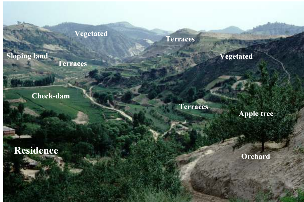
Yangjuangou Catchment in Chinese Loess Plateau, where effectiveness of soil conservation measures in reducing soil erosion/sedimentation was assessed by using fallout radionuclides.