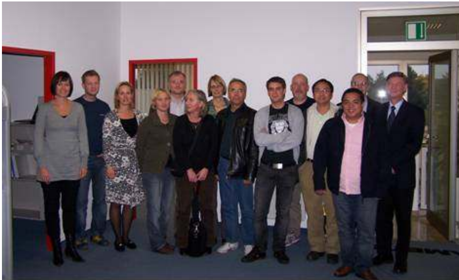
Participants at the European Training Course for Gamma Vision Software 2007

Gamma Vision is one of the main high purity germanium (HPGe) spectroscopy software programmes. This software controls the acquisition and analysis of data collected from HPGe detectors and it allows identification of nuclides by gamma energy emission to quantify the activity concentrations. It is a fully functional windows programme for any PC environment and it includes patented True Coincidence Summing Corrections and Auto Calibration. It is compatible with a complete range of electronics and HPGe detectors.