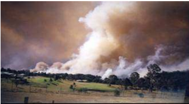
View of the wildfire in the region close to Sydney, Australia

Wildfires occur naturally in many countries and continents. However, they can have serious impacts on human infrastructure, including the provision of fresh water supply. Worldwide, many cities have water supply reservoirs that are forested, prone to wildfire, and thus potentially susceptible to the negative impacts of fires on reservoir water quality. Climate change is also likely to increase the prevalence of fires in those countries that will suffer reduced rainfall patterns. Consequently, it is very important to know in what ways wildfires will impact on reservoirs.