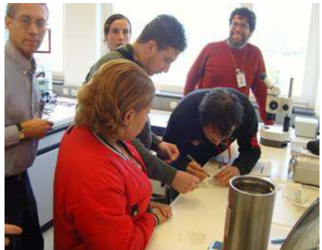
Participants in the Laboratory