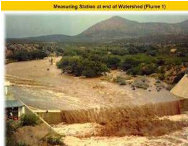
Extreme runoff event at outlet flume at the USDA ARS Walnut Gulch Experimental Watershed