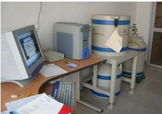
Figure 1. FRN Measurement at ALMERA of CAAS