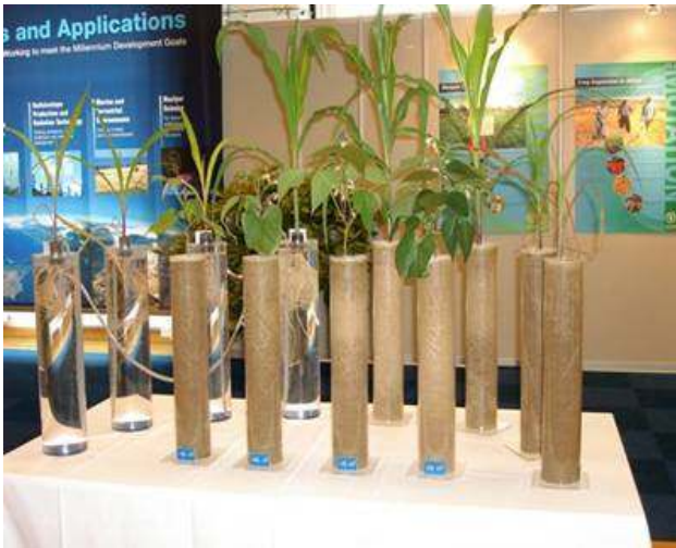
Live display of soil-nutrient-plant interaction at the General Conference

The 51 st General Conference of the IAEA was held from 17 to 23 September 2007. Staff of the SWMCN subprogramme manned the Department of Nuclear Sciences and Application (NSA) display booth during the week, and on Tuesday, 18 September (NAFA theme day) they manned the NAFA display booth, which included publications and promotional material (printed and audio-visual) from all NAFA subprogrammes. Three posters on 'Nuclear techniques for soil erosion control', 'Bringing hope to the drylands' and 'More Crops per Drop' were prepared and displayed by the SWMCN subprogramme. In addition to the posters, the Soil Science Unit mounted a display to demonstrate the interactive effects of fertilizer nitrogen (N) and phosphorus (P) on the root development and growth of cereals and legumes in soil and solution culture media. Maize (cereal) and common beans (legume) were grown in transparent glass tubes in either soil or nutrient solution.