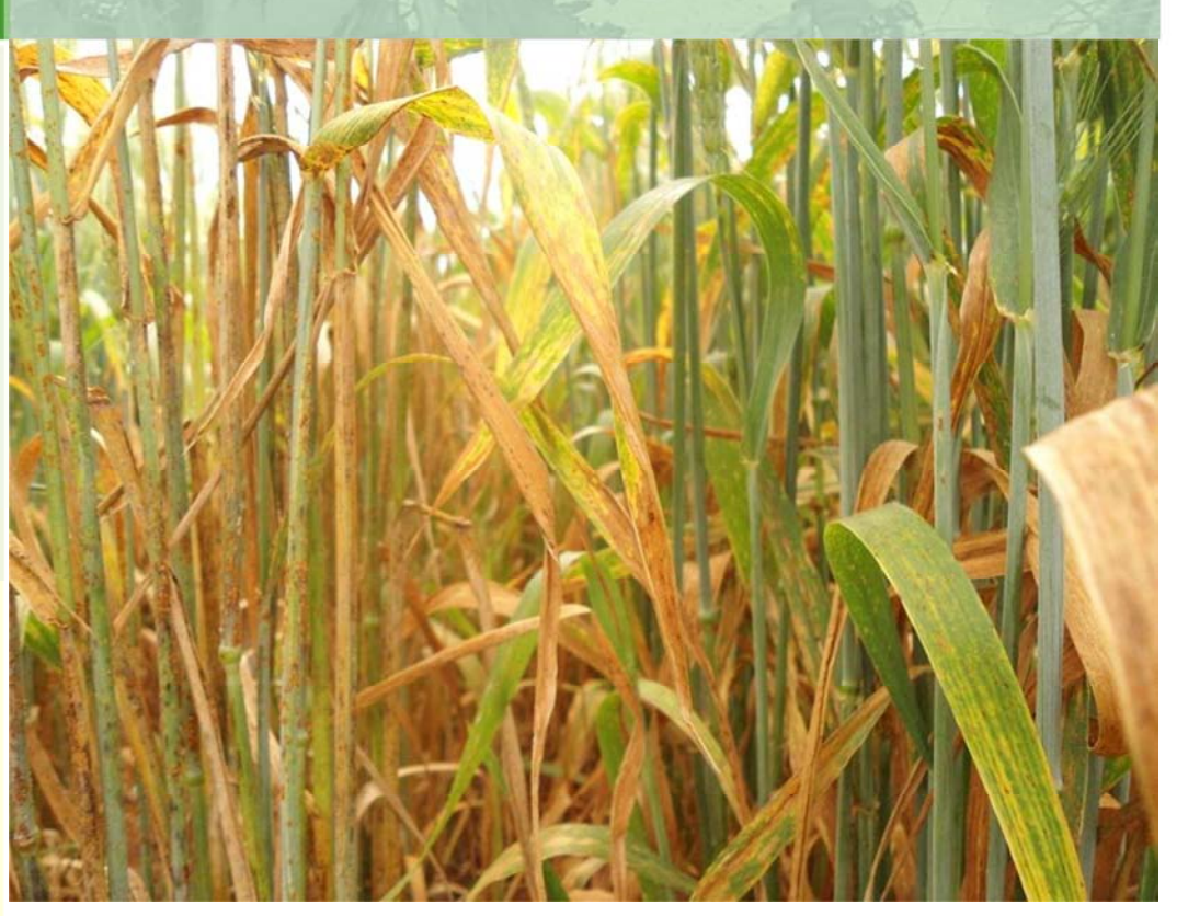
Mutant wheat resistance screening at Moi University, Chepkoilel University College, Eldoret, Kenya