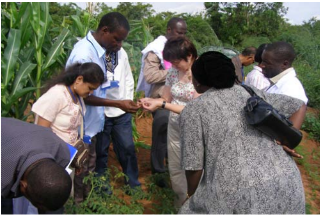
Trainees in the field discussing the appropriate morphological tips for collecting anthers at the adequate stage for haploid production.

According to the feedback received, the course developed in a very positive way, with lectures and practical exercises conducted in a professional and efficient manner.