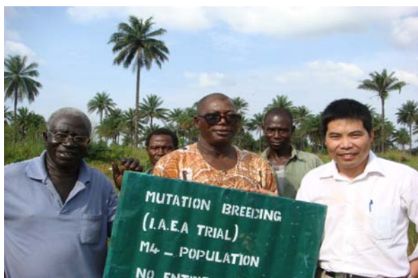
Rice mutation breeding in Sierra Leone

importantly, the rice mutation breeding programme has been shaping up and some mutant lines showed very promising results in the uplands.