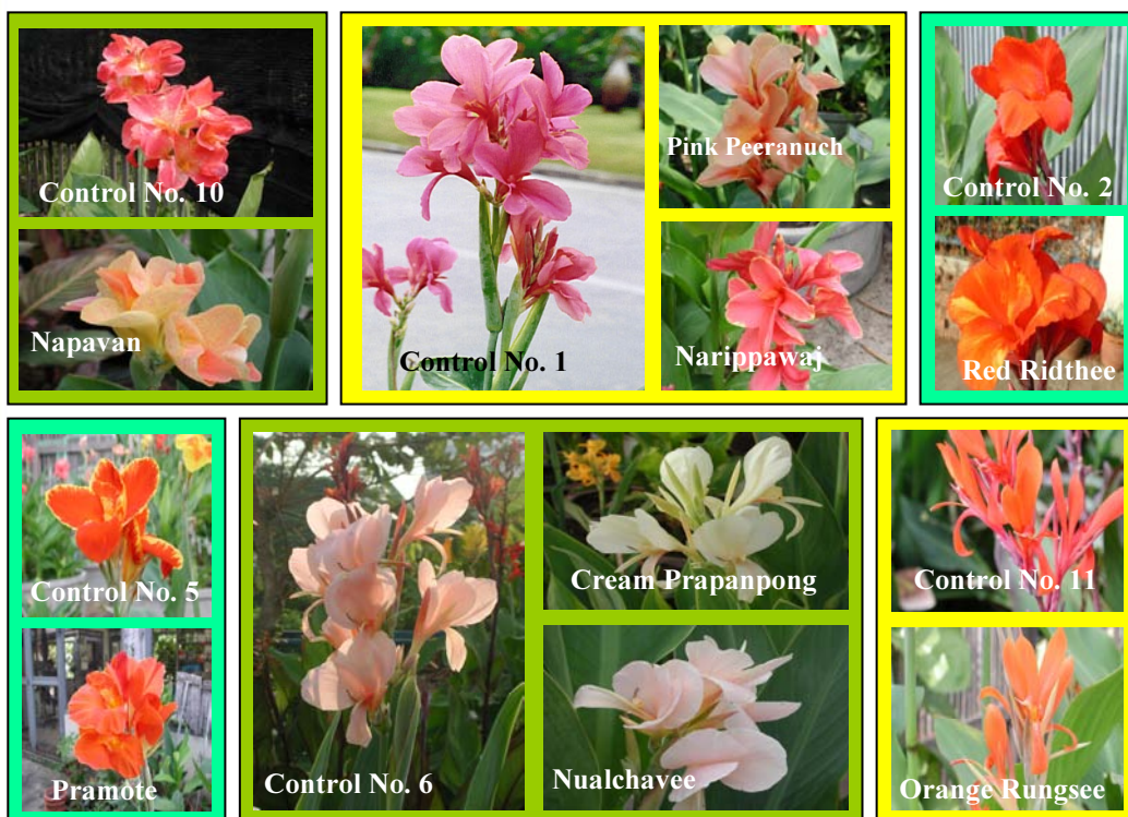
Mutant canna varieties and their parents (control).