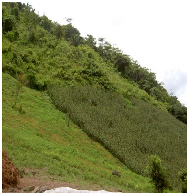
Fig. 2 – Corn and beans grown alternatively on marginal areas.