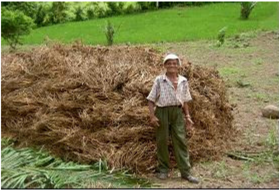
Fig. 1 - Mutation induction may assist in increasing the yield of red beans.

change in the nutrient intake of the Costa Rican population and will certainly improve the livelihood of the farmers.