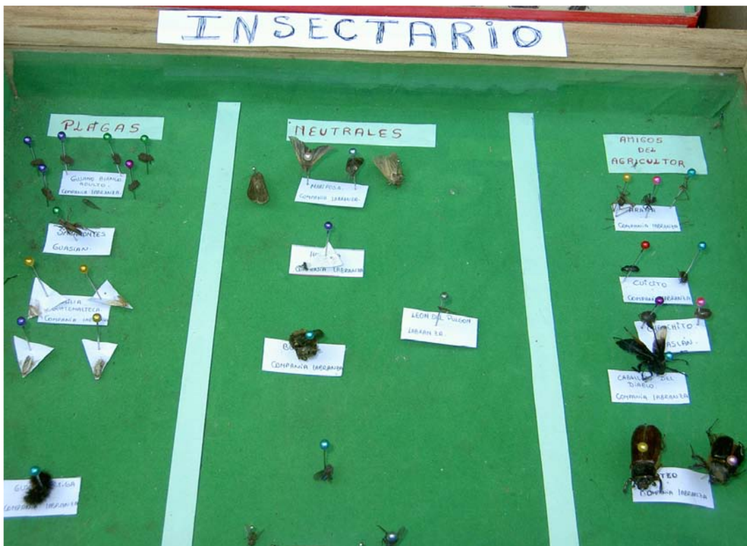
Display of insects by the Potato Farmers' School in Ecuador

A visit to the FAO representation in Ecuador included discussions on the objectives of the current IAEA TC project as well as on the main activities planned for the next cycle with the FAO representative. We were very pleased with his commitment to assist the counterparts in this TC project in organising the national workshop planned for 2008. The different agricultural projects currently conducted by the FAO in Ecuador were presented and several may be connected to this TC project, and collaboration is foreseen. The FAO representative also noted that the FAO/IAEA Joint Division could provide information on animal and crops health issues which are on the rise - such as screw-worm development for cattle and fruit flies - and impeding exports. During the same meeting, we were introduced to the NRAs Coordination Analyst who presented the UNDAF approach in Ecuador and emphasized the need to establish contacts in an effort to coordinate UN interventions in Ecuador, especially for Agencies such as the IAEA which do not have representative offices in the country.