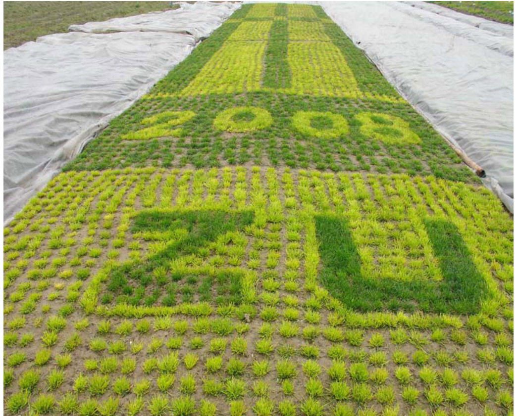
Zhejiang University prepares the soccer field for Olympics 2008 in China using mutant Tef (yellow)