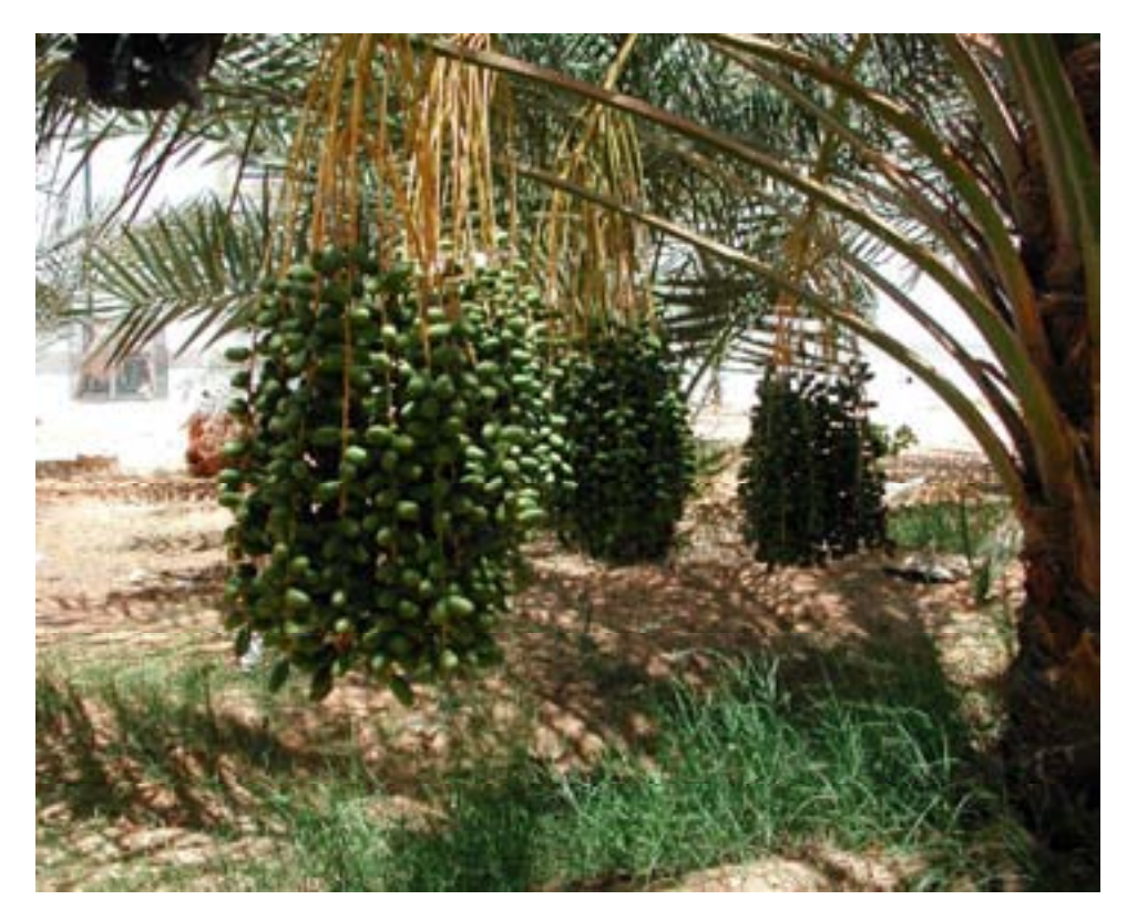
Fruiting in micropropagated date palm tree, variety 'Deglect Noor' -TC project RAF/5/035