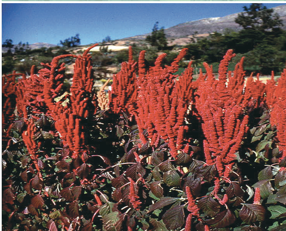
Neglected crops: grain amaranth.