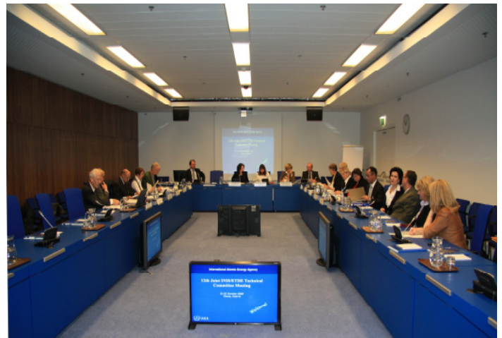
12th JTC Meeting