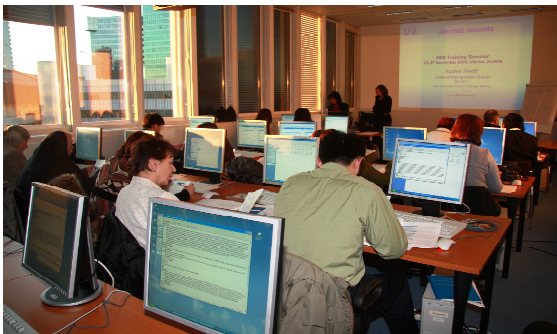
Participants at the INIS Training Seminar

In an attempt to enhance greater future contribution to INIS, participants were encouraged to locate relevant open access literature for inclusion in INIS information re-