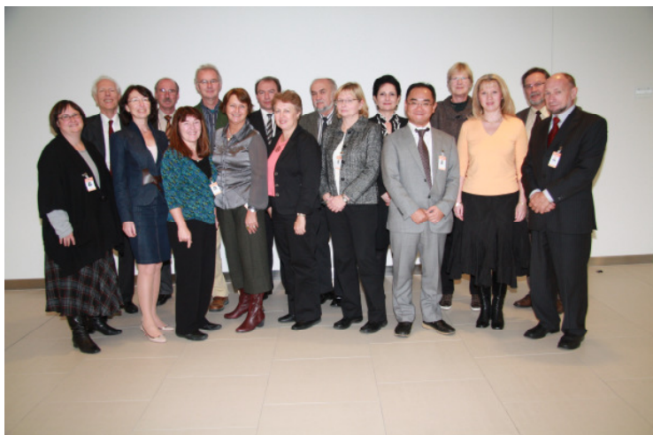
12th JTC Meeting participants

In view of current world challenges and the increasing role that information plays in the process of social, cultural, economic and technological democratization, as well as in overall development and prosperity, the JTC meeting commended INIS for providing free and open access to the INIS Database and non-conventional literature (NCL) on the Internet. At the same time, criteria for gaining access to the ETDE Database will be simplified bringing developing countries closer to that valuable information resource.