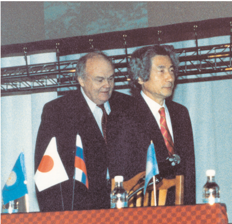
Prime Minister J. Koizumi, accompanied by Acad. E. Velikhov at the conference at the Kurchatov Institute in Moscow

During his official visit to the Russian Federation, Mr. J. Koizumi, Prime Minister of Japan, was invited to speak on 11 January 2003 to the participants in the International Scientists Conference to commemorate the 100th birthday of Academician I.V. Kurchatov. In the box there are some excerpts from his speech.