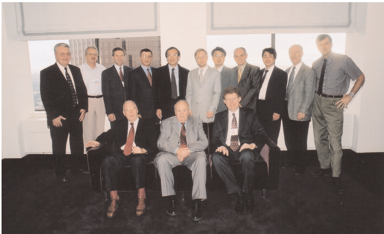
Participants in the Meeting