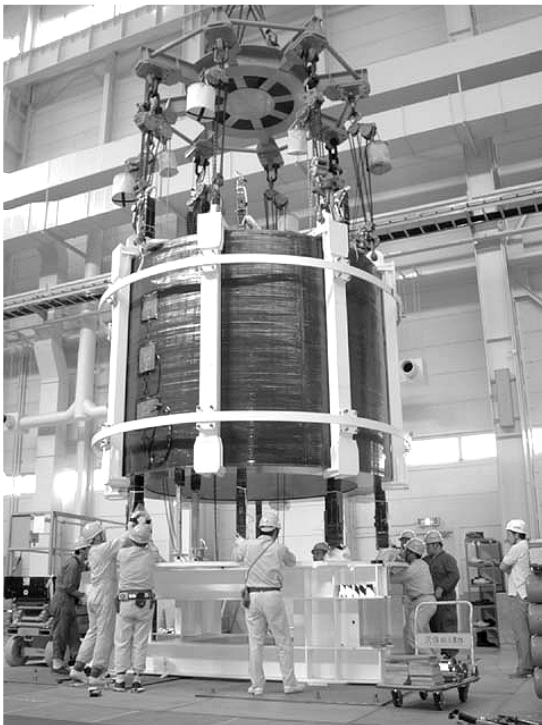
The CS Model Coil Outer Module taking off the stand

On 15 June, the CS Model Coil Outer Module took off the coil stand on which it had been waiting for this lifting day to come for 7 months and landed encircling the CS Model Coil Inner Module. The difference between the outer radius of the Inner Module and the inner radius of the Outer Module is a bit less than 10 mm and the height of the coils is 3 m. Due to this fact, special care was taken so as to position the Outer Module without damaging the insulating surface of both coils. Subsequently, the process of installation kept the team busy for almost 5 hours, but, as a result, the CS Model Coil Outer Module was successfully installed in the testing vacuum tank.