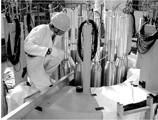
Quality Assurance inspectors checking the Inner Module position

On the next day, the Inner Module was landed on the supporting structure and Quality Assurance inspectors confirmed that the coil was placed correctly as designed. Therefore, the CS Model Coil Inner Module was successfully placed on the coil supporting structure in the vacuum tank on 10 June.