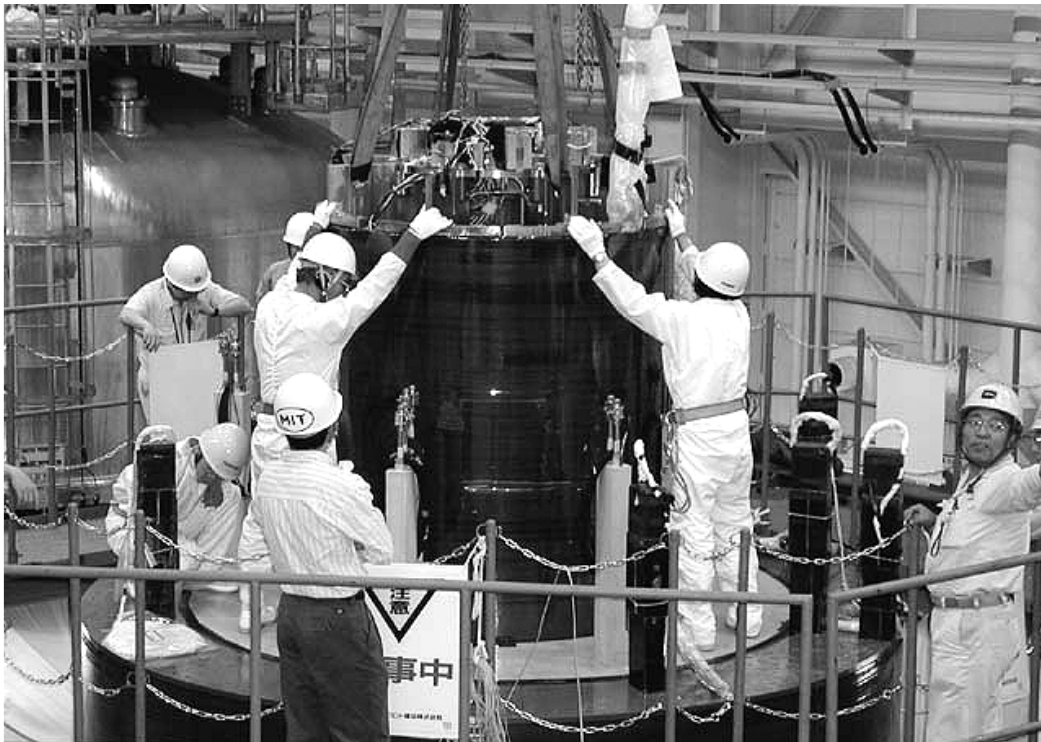
Taking slowly down the Insert Coil, so as not to damage the insulating surface of the coils