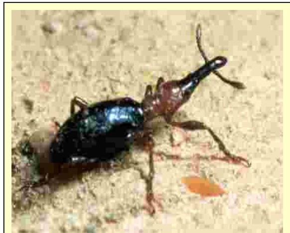
Cylus formicarius

As from early 1999, an SIT component was then successfully integrated into the control strategy. The aerial release is done by helicopter from which paper bags (9x20.5cm) containing 1,000 SPW adults of both sexes are released at a rate of 500 to 2,000 individuals per hectare. Initially, 100,000 sterile SPW adults were released weekly over Kume Island. As from 2001, following the increase in production capacity, a total of 1 million adults are released weekly. From 1999 until the first