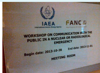
Workshop on Communication with the Public in a Nuclear or Radiological Emergency, Brussels, Belgium.