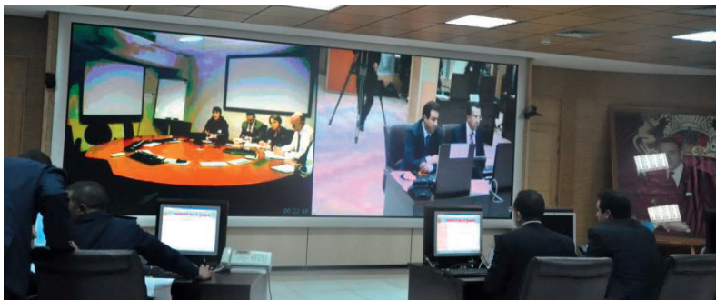
Authorities in Morocco participating in a video conference during the ConvEx-3 (2013) 'Bab Al Maghrib' exercise. Rabat, 20 November 2013.

The initial assessment and feedback underscore that this exercise was well prepared and achieved its objectives. The Incident and Emergency Centre (IEC) wishes to express gratitude to the Moroccan Government for providing the IAEA, its Member States and relevant international organizations the opportunity to evaluate their response to a severe radiological emergency.