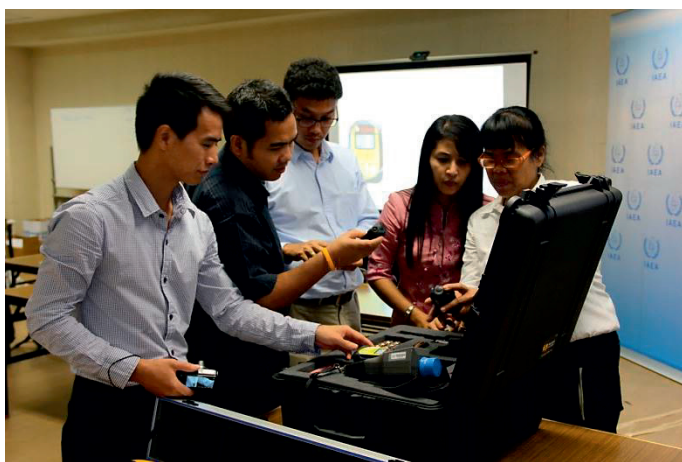
Participants getting familiar with the monitoring tools to be used during field exercises at the Fukushima RANET Capacity Building Centre, 6 October 2013.

As part of its work to strengthen Member State capabilities to prepare for and respond to nuclear or radiological emergencies, the IEC conducted a workshop in the Fukushima prefecture from 7–11 October 2013 on monitoring and sampling during a nuclear or radiological emergency. More than 20 participants from 7 Member States of the Asia and Pacific region (Indonesia, Malaysia, Myanmar, The Philippines, Singapore, Thailand and Vietnam) tested their skills during the five-day workshop, which offered both theoretical and hands-on training.