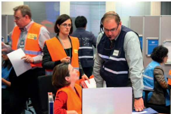
The screening officer, the logistics officer and an evaluator testing their response skills during the Full Response Exercise, 30 October 2013.

On 30 October 2013, the IEC conducted an internal Full Response Exercise, as part of the IEC's effort to enhance its internal training programme. The exercise was conducted from 09:00 to 12:00 (Vienna time) and allowed a number of recently trained staff members to practice their roles in the IAEA Incident and Emergency System.