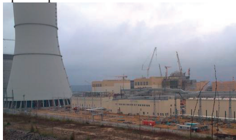
The new nuclear power plant site under construction at Novovoronezh, Russian Federation.

Between October and December 2013, the IEC conducted Emergency Preparedness Review (EPREV) preparatory missions in South Africa and Kuwait, and participated in Integrated Regulatory Review Service Missions (IRRS) in Belgium, the Czech Republic, the Russian Federation and the United States of America (preparatory mission). The IEC will conduct over eight EPREV missions and participate in ten IRRS missions in 2014.