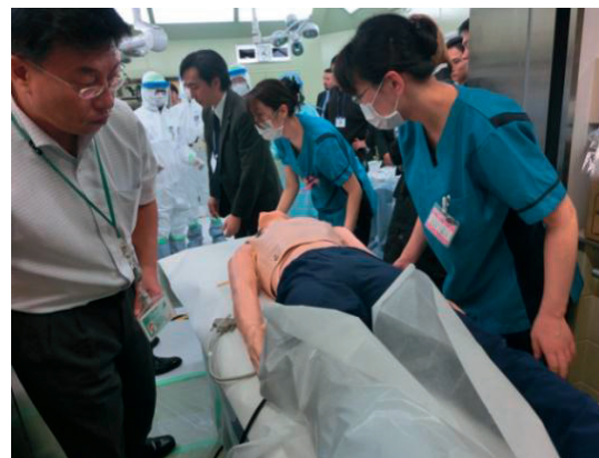
Participants during the exercise: the 'patient' entering the room for decontamination. Hiroshima, 29 October 2013.

According to the objectives planned and the participants, lecturers and organizers' expectations, the workshop was very successful. The organizers have expressed their willingness to continue working in cooperation with the IAEA-IEC for future events in the field of medical response to radiation emergencies.