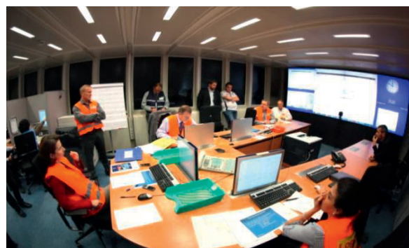
The IEC's operations area and IAEA staff members during the Full Response Exercise, 30 October 2013.

The IEC is always looking for opportunities to participate in exercises with the relevant Competent Authorities in Member States. If you are interested in having the IEC participate in your national exercise, please contact the Centre at iec-information@iaea.org .