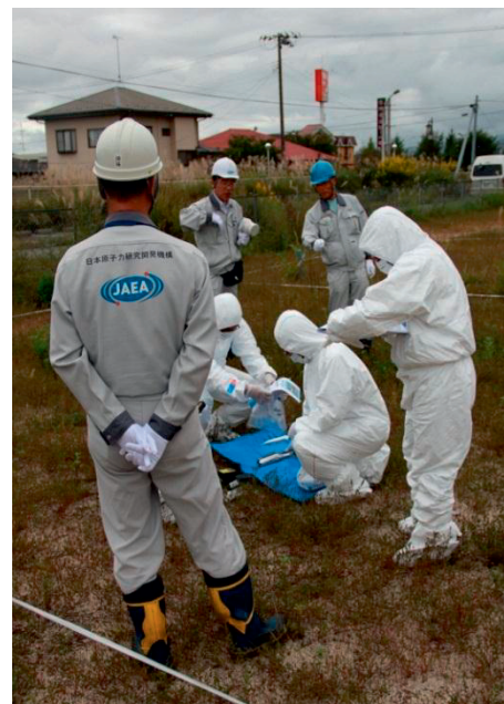
Experts from Japan's Atomic Energy Agency supporting participants during soil sampling exercises performed in a field near the Fukushima Daiichi Nuclear Power Station, 9 October 2013.

Two days were spent performing field exercises in Fukushima Prefecture areas that remain evacuated following the 2011 accident at TEPCO's Fukushima Daiichi Nuclear Power Station. The training area's conditions gave the participants an opportunity to learn crucial aspects of radiological monitoring and environmental sampling that need to be performed during a nuclear or radiological emergency.