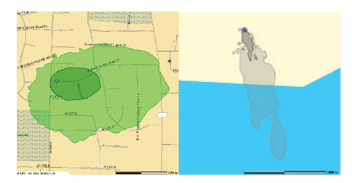
Example of IXP output of dispersion modelling using live weather data.

Both IXP and Hotspot can be used for the modelling of plume dispersions based on user defined release criteria. Hotspot uses straightforward modelling techniques limited to a single wind direction and basic weather input, whereas IXP allows for the simulation of dispersions in complex weather configurations using historical, live or predicted weather data that can vary.