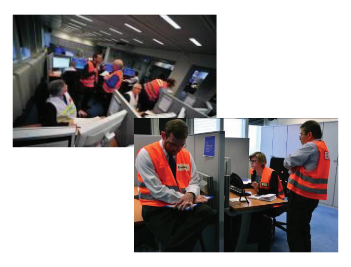
Scenes from the Full Response Mode Exercise held on 21 November 2012 in the IEC (Photo Credit: D. Calma/IAEA).

This was the third Full Response Mode exercise conducted by the IEC in 2012.