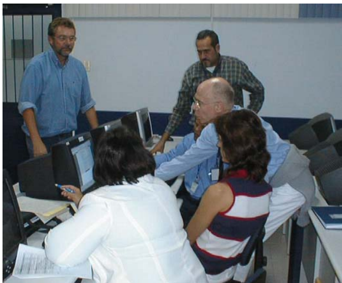
Group exercise during the launch of the eLearning system and courses at the workshop on Distance learning for capacity building on pesticide management

important issues in technology transfer, and the importance of life-long learning.