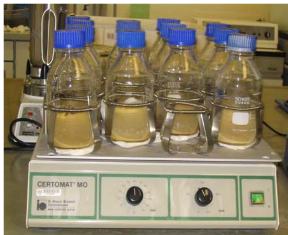
2) The Fumonisin B1 (FB1) is extracted from maize samples with a methanol-water solution (3:1).