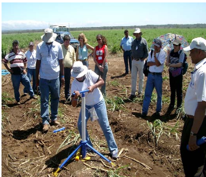
Field trip & group exercises demonstrating the close relationship between water management/ irrigation & pesticide/ fertilizer management

In addition, IUPAC project leaders participated in a panel discussion, connecting leading international experts with national counterparts, thus building contacts and expand networking.