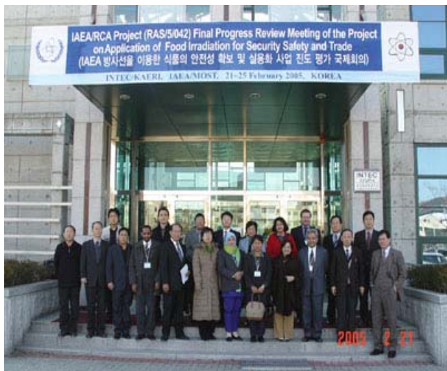
Group of participants, IAEA/ RCA Final Progress Review Meeting, Daejeon, Korea