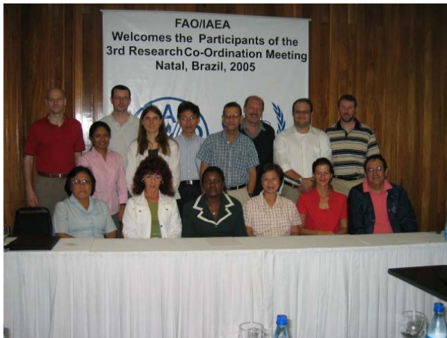
Group photo of participants at RCM, Natal, Brazil, April 2005

A protocol for the validation of immunoassays will be provided by a Research Agreement Holder. The protocol has already been successfully applied for validation of an RIA method in Brazil. It is recommended that this protocol be adopted by all participants in the project to harmonize the validation of immunoassay methods developed.