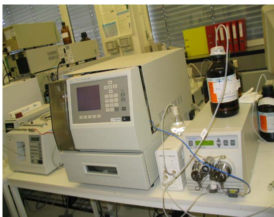
5) The detection is carried out by reverse-phase liquid chromatography with fluorescent detection.