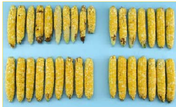
Contaminated maize samples

In 1988, Gelderblom and colleagues discovered a class of mycotoxins called Fumonisin. Fumonisin B 1 is the most common and is the most thoroughly studied. Corn is the major commodity affected by this group of toxins.