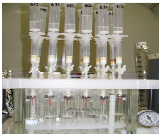
4) The residue is dissolved in acetonitrile:water (1:1) and o-phthalaldehyde (OPA)-2-mercapto ethanol is added to form the fluorescent fumonisin derivative.