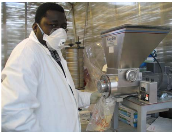
1) Grinding of the maize samples.