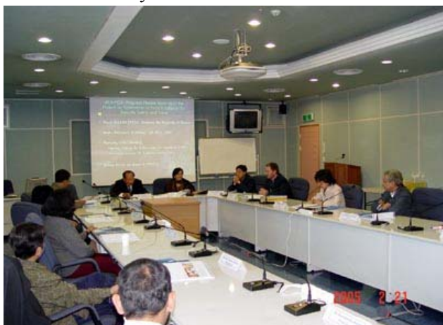
Participants in the IAEA/RCA Final Progress Meeting, Daejeon, Korea

They finished the third day with a visit to the Co-60 commercial irradiation facility in Korea, which has been in operation since 1987. The plant is located in Yeosu, about 70 km from Seoul. During the last two days of the meeting, the participants wrote the report and discussed a new TC regional project on food irradiation to be presented for the TC cycle 2007-2008.