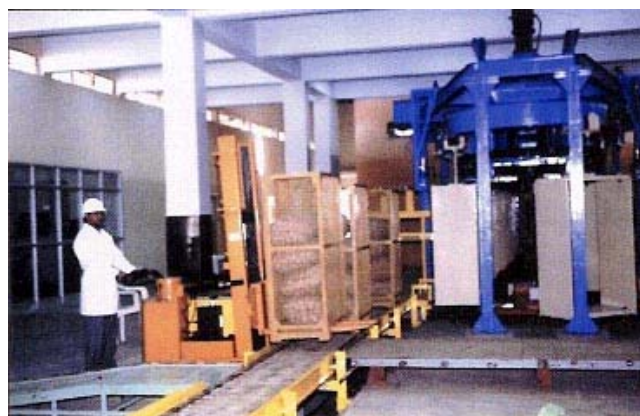
Irradiation of potatoes, KRUSHAK facility, India

At present, a dozen Memoranda of Understanding have been signed between the entrepreneurs and the BARC/Board of Radiation and Isotope Technology (BRIT) for setting up multi-product radiation processing facilities. About four of them have already finalized the financing arrangements and construction has begun.