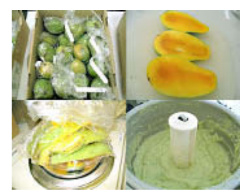
Preparation of Mango samples