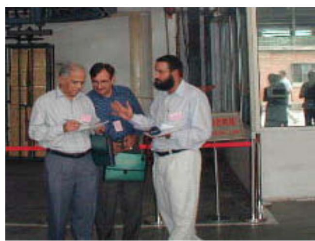
Auditing exercise at the Irradiation Center of the Chinese Academy of Agricultural Science in Beijing, part of the training workshop on Quality Assurance System of Irradiatin Facilities, 23-27 August 2004

The training course included different subjects, such as general concepts on quality assurance, efficient and safe operation of irradiation facilities, dosimetry, traceability, quality of the foods to be irradiated, HACCP, audit, development of food irradiation and international standards. The training course was complemented with an exercise of audit at the irradiation facility of the Irradiation Center of the Chinese Academy of Agricultural Science in Bei jing.