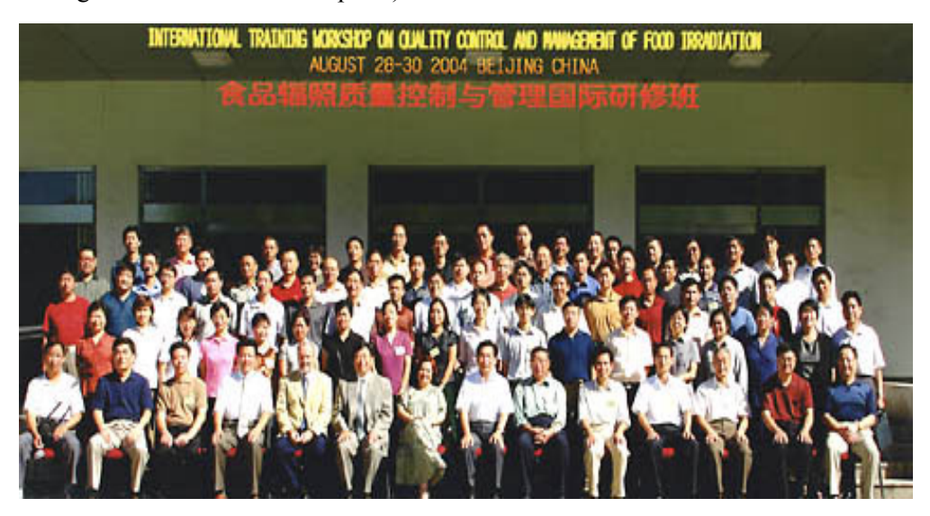
Participants of the National Training Workshop Quality control and Management of Food Irradiation 28-30 August 2004

The training course, as well as the national workshop, constituted a good forum to exchange experiences in the operation of irradiation facilities and discuss future activities among the participants.