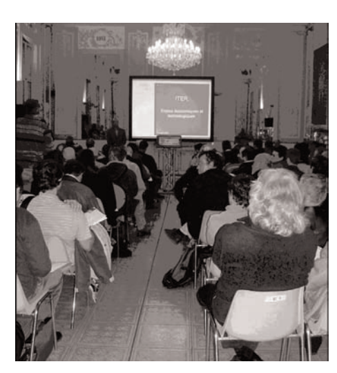
Thematic meeting in Salon de Provence