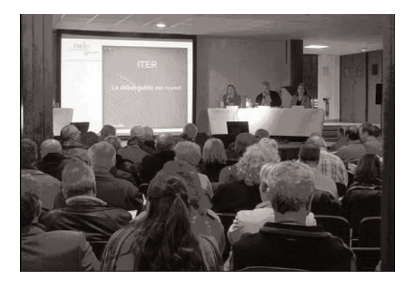
General debate meeting in Ste Tulle, close to Manosque

Four general information meetings were organised in surrounding centres of population: Ste Tulle (2 February), Avignon (9 February) and Nice (16 February), and Gap (30 March). While the meeting in Ste Tulle was also disturbed by demonstrators; the meetings in Avignon and Nice were held in a friendly and calm atmosphere.