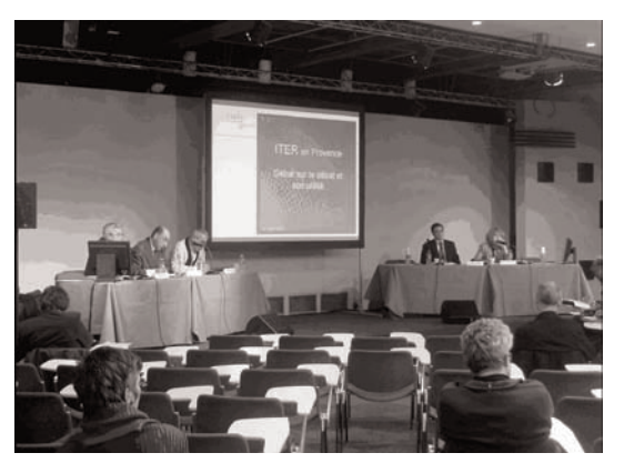
Special meeting in Marseille