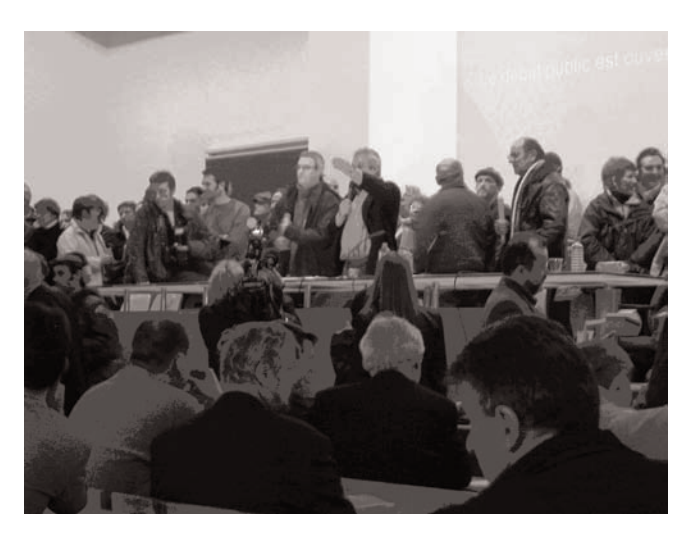
Demonstrators occupy the stage at the opening meeting in Aix-en-Provence

and was made available on the internet site managed by the CPDP (http://www.debatpublic-iter.org). The file was approved by the International Team in December 2005 and sent to the CPDP jointly by the IT Leader and the Director of CEA Cadarache. The Public Debate opened on 16 January 2006 and a press conference was held on 20 January.