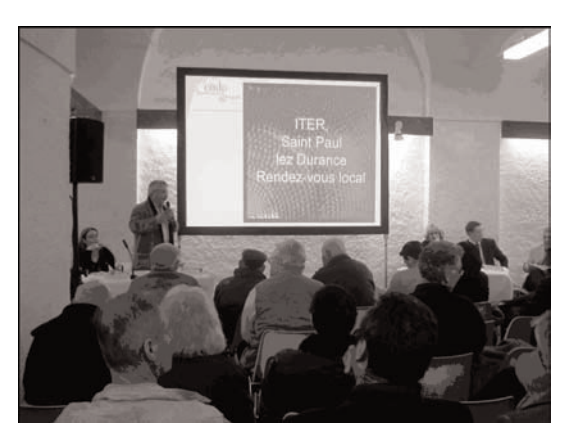
Local meeting in St Paul lez Durance

Local meetings also took place in the closest communities - in St Paul lez Durance (24 February), Vinon-sur-Verdon (6 April) and Beaumont de Pertuis (27 April). Local people were invited to discussions with members of the CPDP in the afternoon, followed by an evening debate session. Mostly local impact issues were discussed at these meetings.