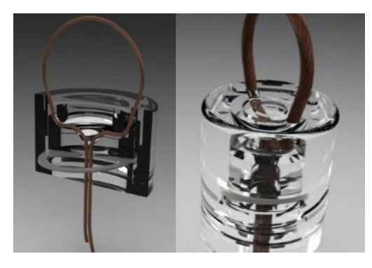
IAEA prototype glass seals