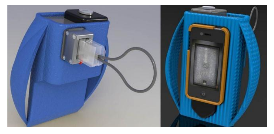
IAEA prototype Cobra verifier (iCobra)